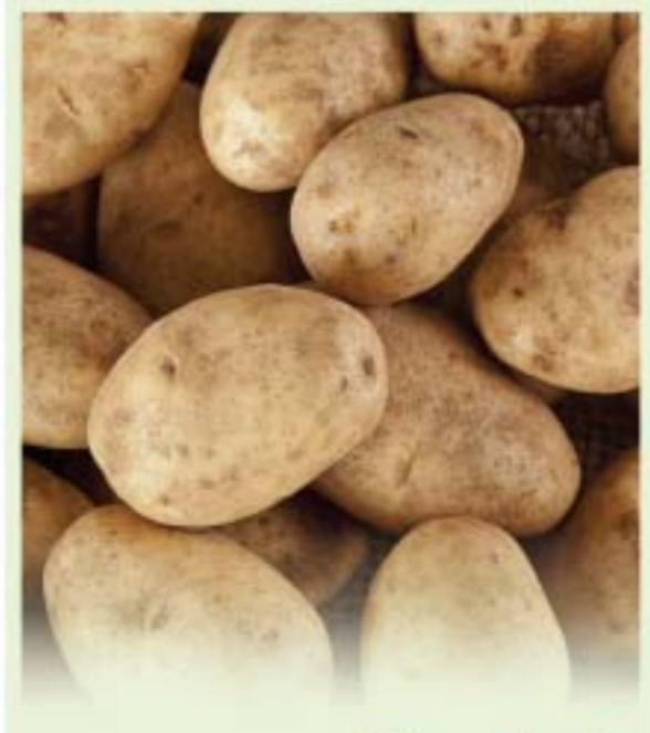
Potatoes 10 lb. bag