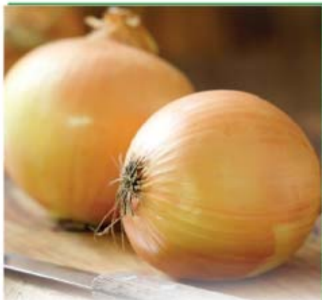
Brown or Yellow Onions