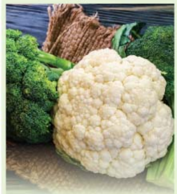
Broccoli or Cauliflower