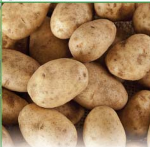
Potatoes 10 lb. bag