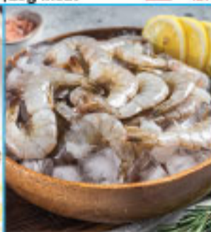
Jumbo Raw Shrimp 16-22 count 699 lb.