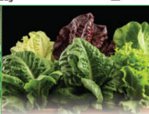
Red, Green Leaf or Romaine Lettuce