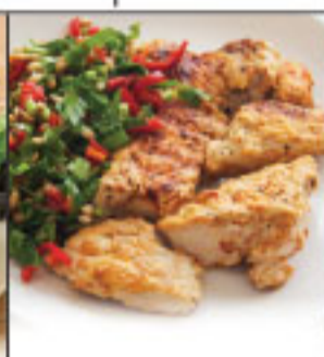
Fresh, Never Frozen Boneless Skinless Chicken Leg Meat 249 lb.