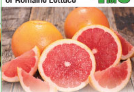
Pink Grapefruit 5 lb. bag