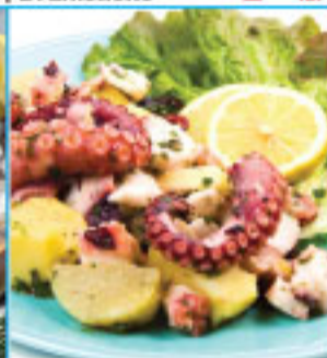
Wild Caught Whole Octopus 599 lb.