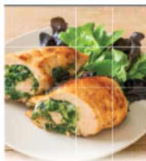
Fresh, Never Frozen Boneless Skinless Chicken Breast 299 lb.