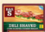
Bar-S Deli Shaved Turkey Breast 8 oz.