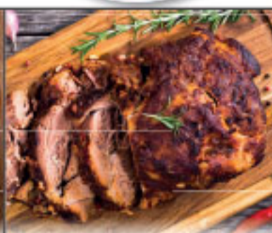
Fresh Pork Shoulder Butt Roast 229 lb.