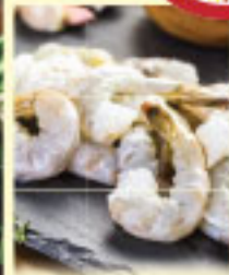
Extra Large Raw Shrimp 26-30 count 549 lb.