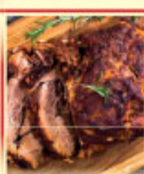
Fresh Pork Shoulder Butt Roast 199 lb.