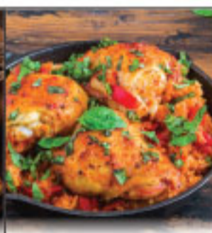
Fresh, Never Frozen Chicken Thighs 197 lb.