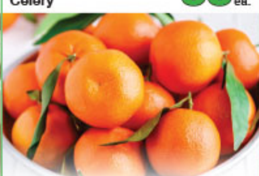
Mandarins 2 lb. bag