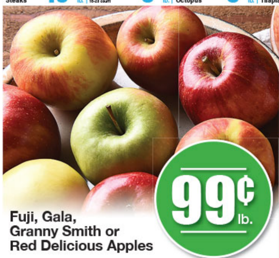
Fuji, Gala, Granny Smith or Red Delicious Apples