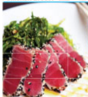
Wild Caught Ahi Tuna Steaks 1099 lb.