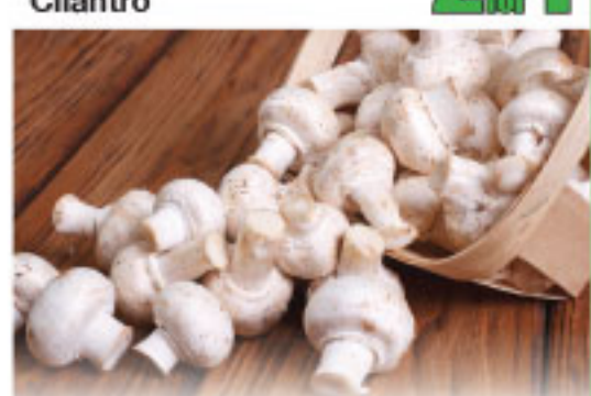
Monterey Whole White Mushrooms 8 oz pkg.