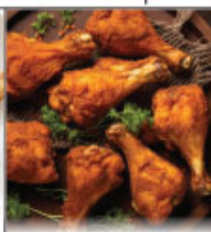
Fresh, Never Frozen Chicken Drumsticks 159 lb.