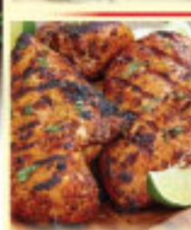
Fresh, Never Frozen Boneless Skinless Chicken Breast 219 lb.