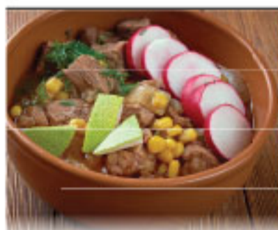
Fresh Boneless Pork Cubes, Pork Carnitas or Pozole Meat 299 lb.