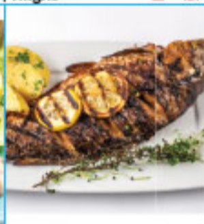
Clean Ready to Cook Whole Tilapia 269 lb.