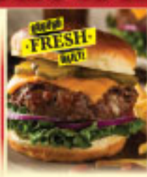
90% Extra Lean Ground Beef 599 lb.