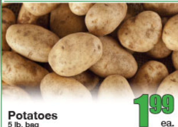
Potatoes 5 lb. bag