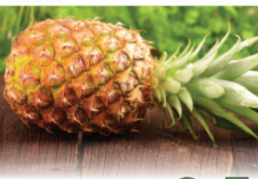
Gold Pineapple 2 for 5