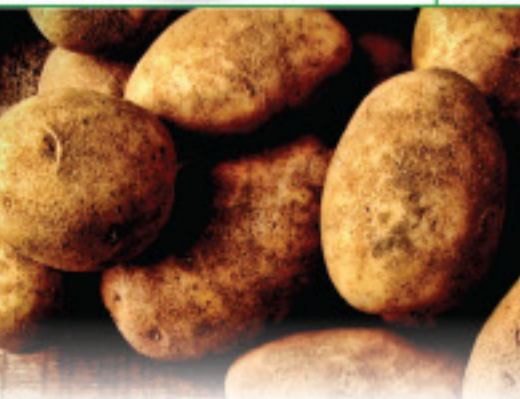
Premium Russet Potatoes 69¢ lb.