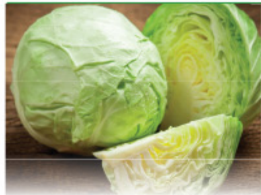
Green Cabbage 79¢ lb.