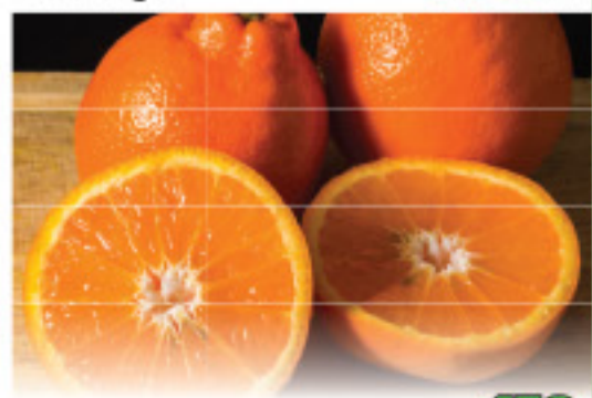
Tangelos Minneola 1.79 lb.