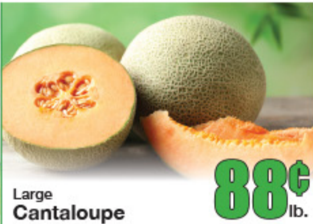
Large Cantaloupe 88¢ lb.