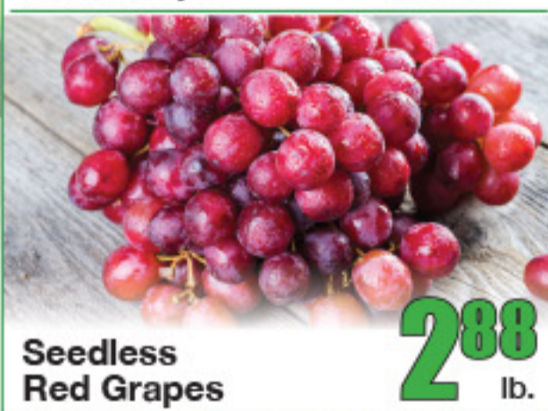
Seedless Red Grapes 2.88 lb.