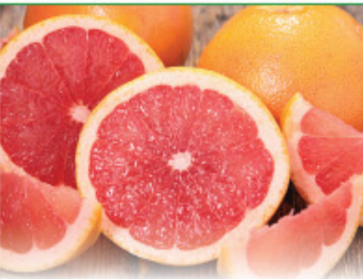
Pink Grapefruit 2 for 3