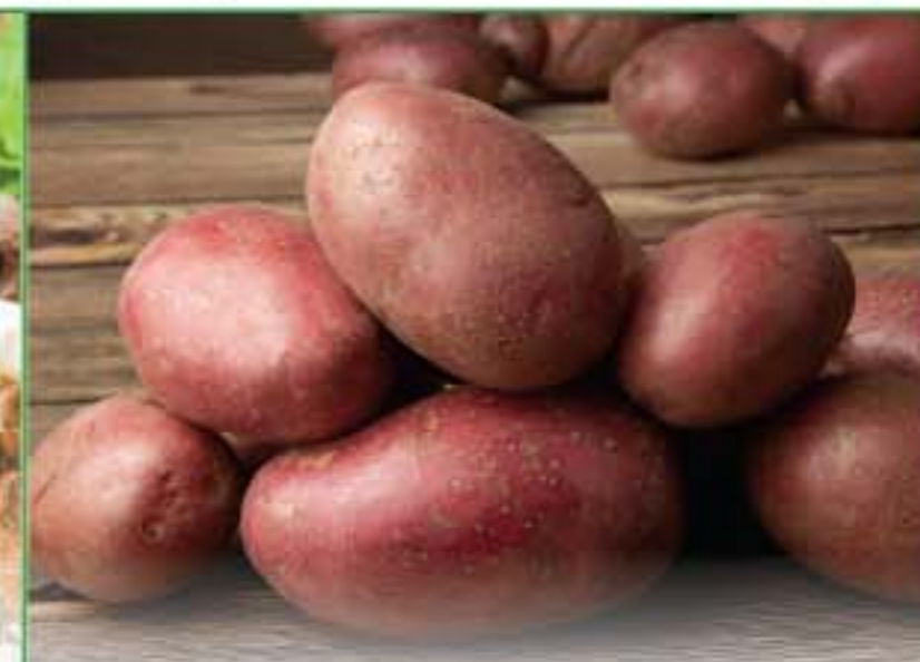
Red Potatoes 69¢ lb.