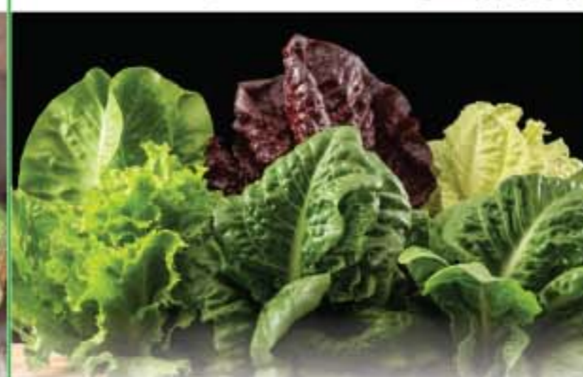
Romaine, Red or Green Leaf Lettuce 2 for 3