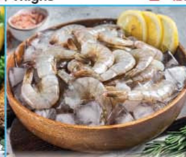
Mexican Wild Caught Large Raw Shrimp 26-30 count 7.99 lb.