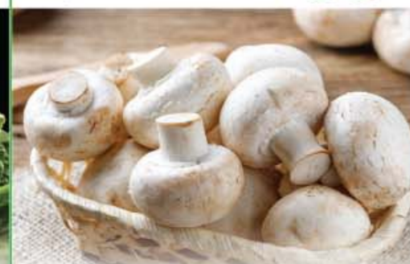
Monterey Whole White Mushrooms 8 oz. 1.99 ea.