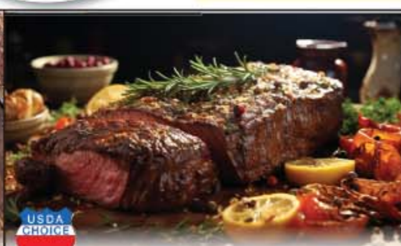
USDA Choice Eye of Round Roast 6.49 lb.