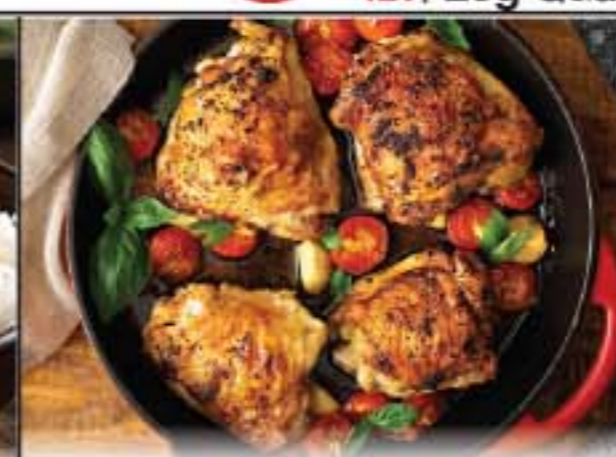
Fresh Never Frozen Chicken Thighs 1.97 lb.