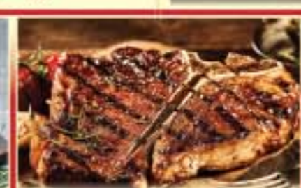
Mix Pack T-Bone or Porterhouse 6.99 lb.