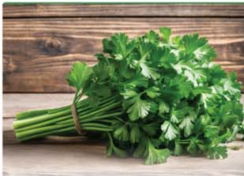
Cilantro 3 for 1