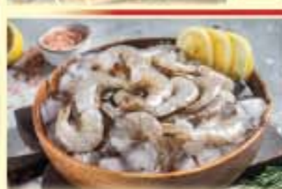
Extra Large Raw Shrimp 26-30 count 4.99 lb.