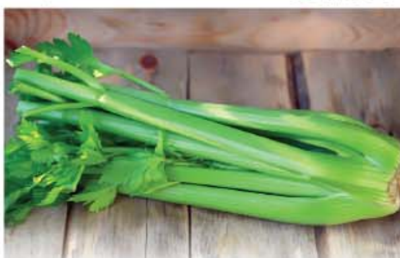
Celery 99¢ ea.