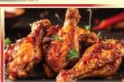
Fresh Never Frozen Chicken Drumsticks 99¢ lb.