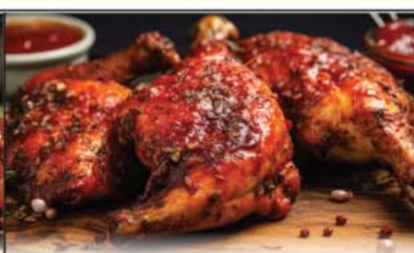
Fresh, Never Frozen Chicken Leg Quarters 1.19 lb.