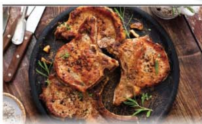
Center Cut Pork Loin Chops 3.39 lb.