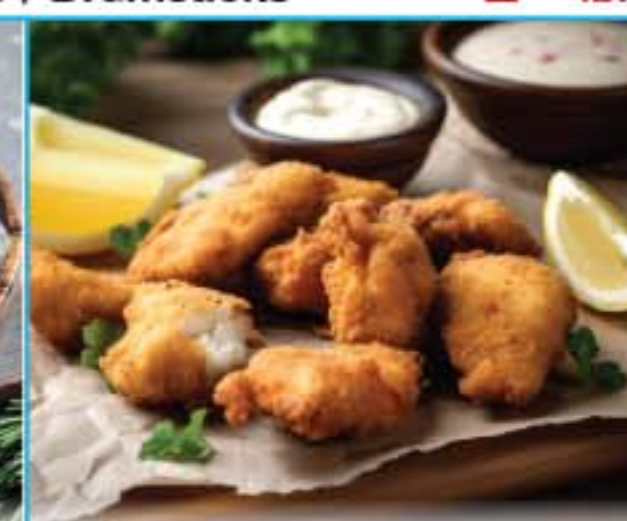
Ready to Cook Catfish Nuggets 2.99 lb.