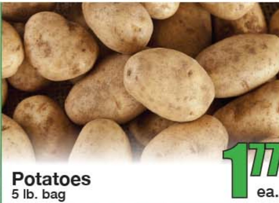
Potatoes 5 lb. bag 1.77 ea.