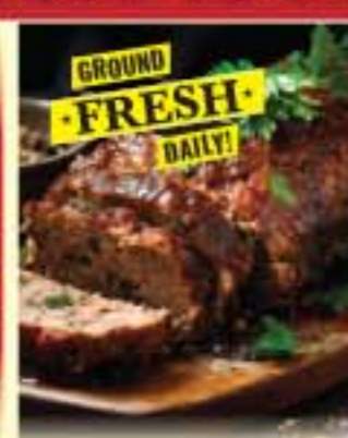
85% Lean Ground Beef 5.49 lb.