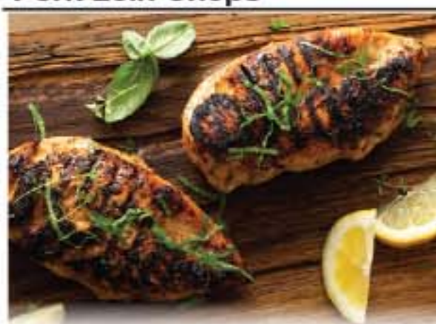
Fresh Never Frozen Boneless Skinless Chicken Breast 2.99 lb.