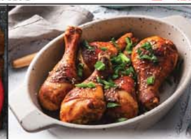
Fresh Never Frozen Chicken Drumsticks 1.59 lb.