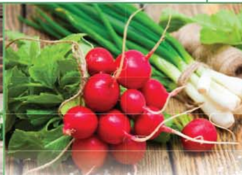
Green Onions or Bunch Radish 2 for 1