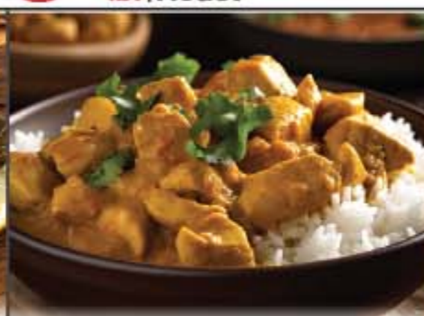
Fresh Never Frozen Boneless Skinless Chicken Leg Meat 2.49 lb.