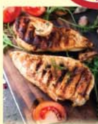
Fresh Never Frozen Boneless Skinless Chicken Breast 2.29 lb.