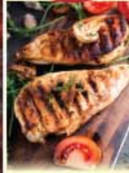
Fresh Never Frozen Boneless Skinless Chicken Breast