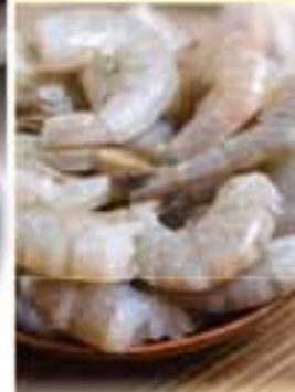
Extra Large Raw Shrimp 26-30 count