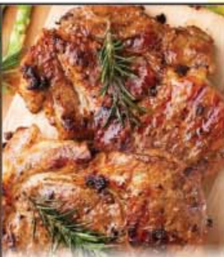
Fresh Pork Butt Steaks