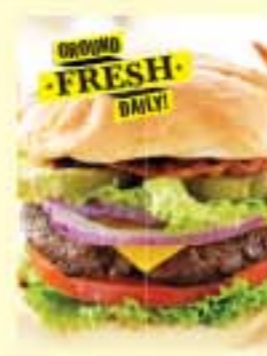
85% Extra Lean Ground Beef