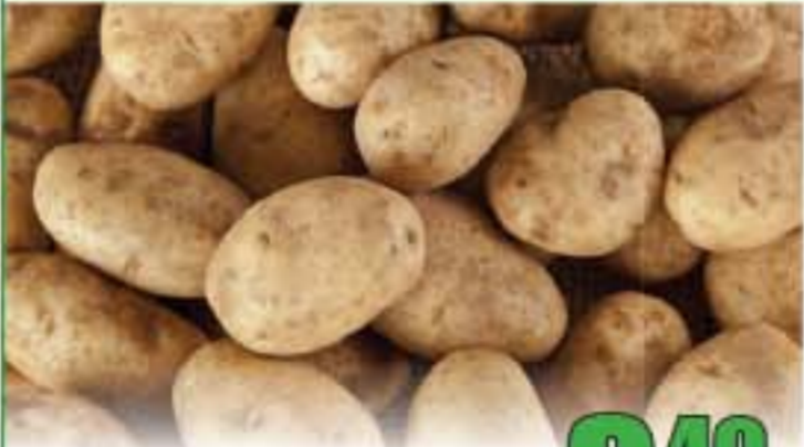
Potatoes 10 lb. bag