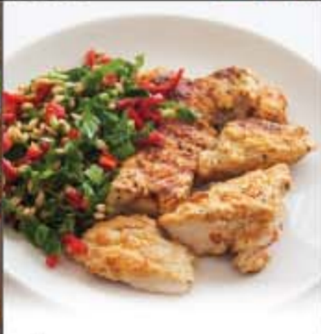
Fresh, Never Frozen Boneless Skinless Chicken Leg Meat