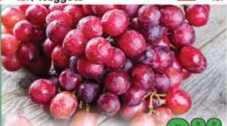
Seedless Red Grapes