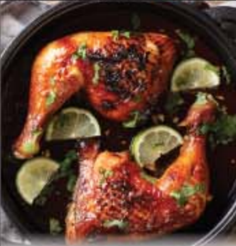
Fresh, Never Frozen Chicken Leg Quarter