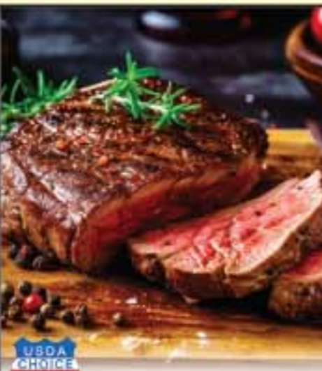
USDA Choice Center Cut Beef Cross Rib Roast