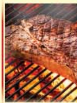
T-Bone & Porterhouse Mix Pack