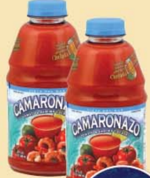
Camaronazo Michelada Cups .38 oz.