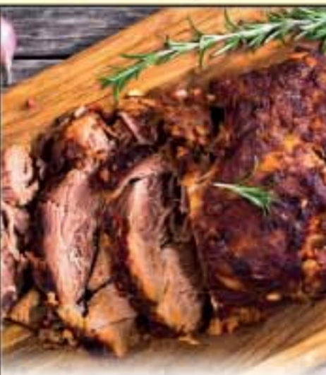
Fresh Pork Butt Roast