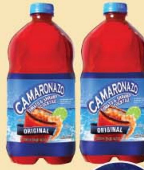
Camaronazo Tomato & Shrimp Cocktail 32 oz.