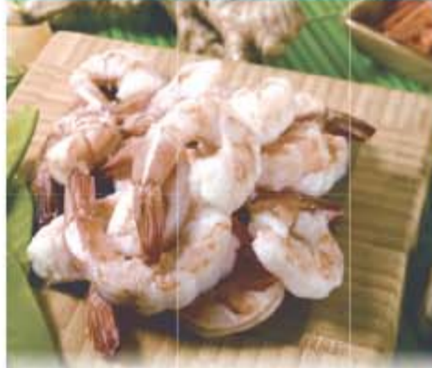
Jumbo Raw Shrimp 16-20 count