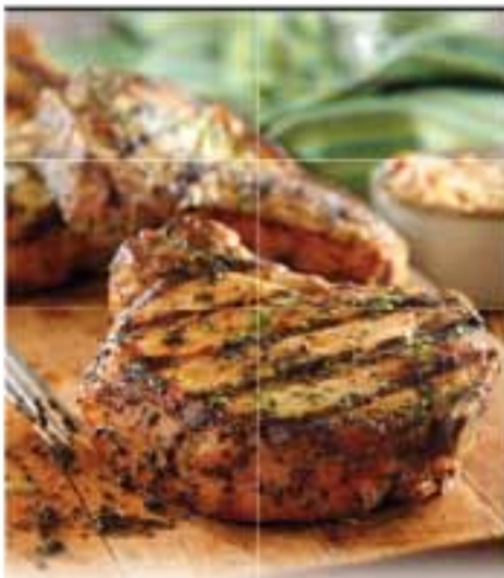
Center Cut Pork Loin Chops