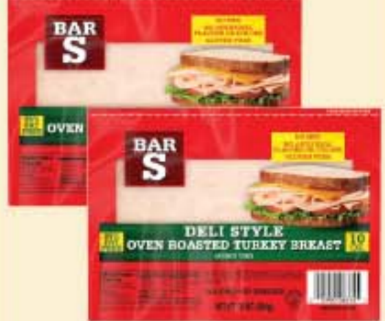
Bar-S Deli Style Turkey 10 oz. 2 for 7