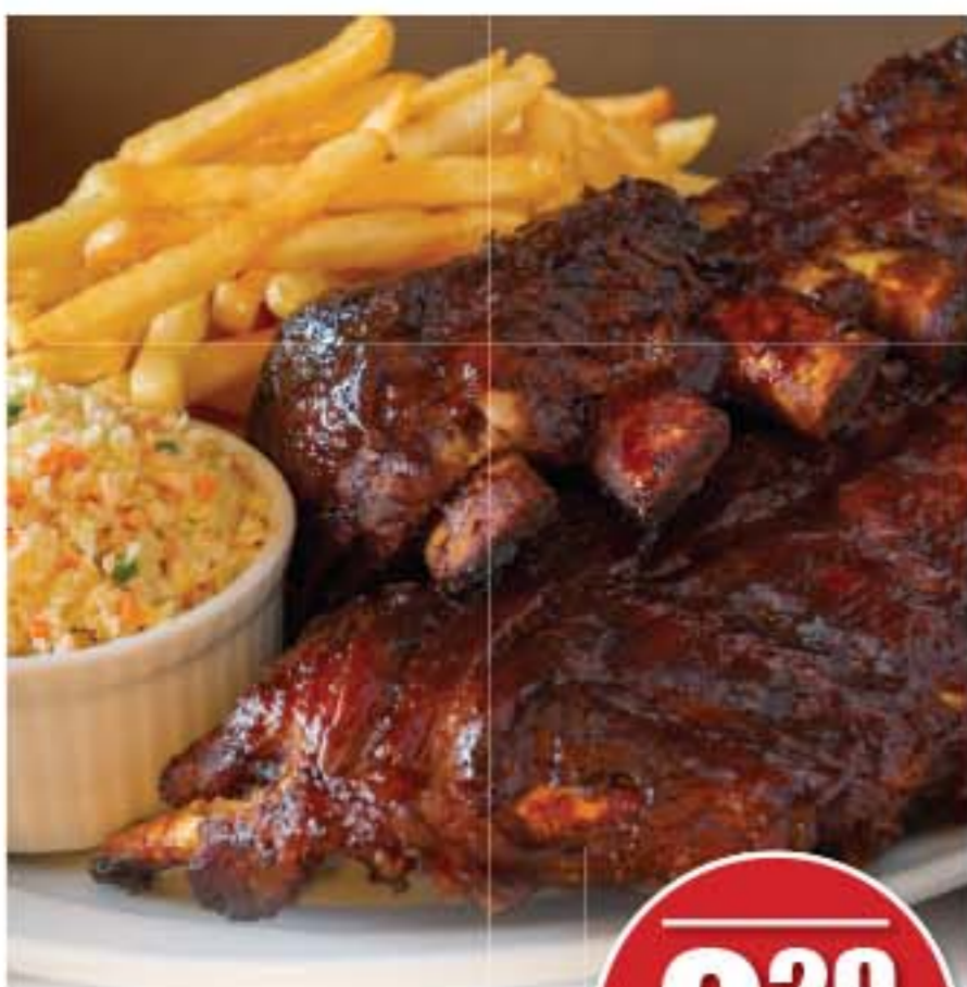
Country Style Pork Sirloin Rib