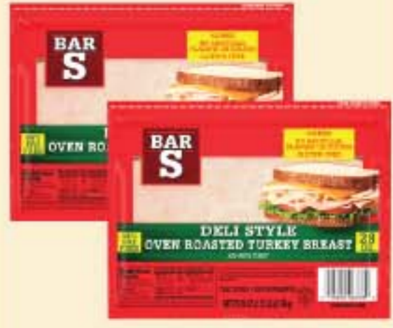
Bar-S Deli Style Turkey 28 oz. 9.99