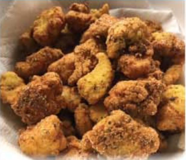
Clean Catfish Nuggets