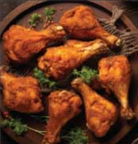
Fresh, Never Frozen Chicken Drumsticks