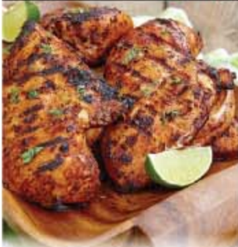
Fresh, Never Frozen Boneless Skinless Chicken Breast