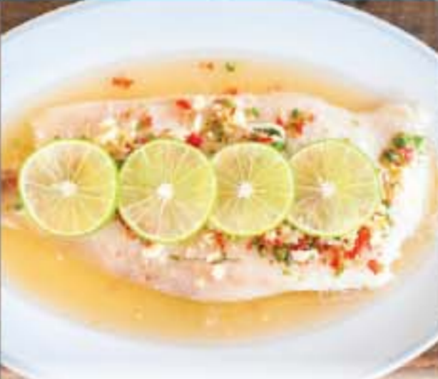
Clean Ready to Cook Basa or Swai Filet