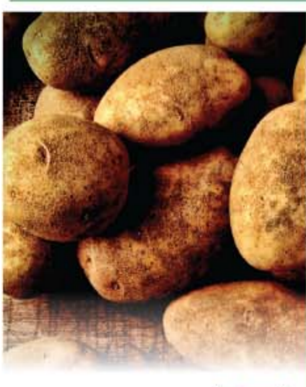
Premium Russet Potatoes