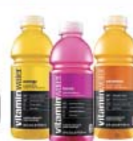
Vitamin Water 20 oz.