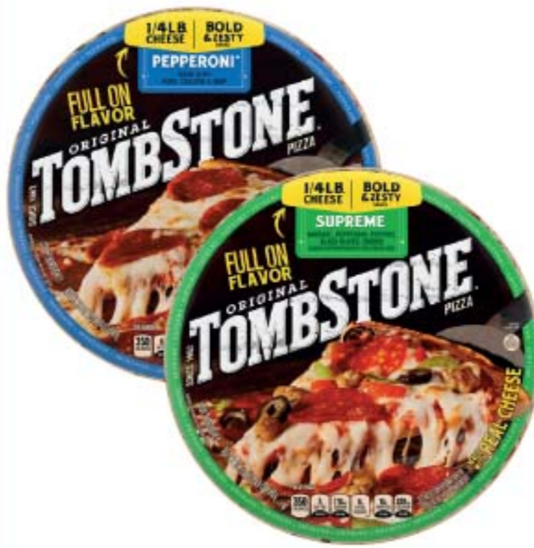
Tombstone Pizzas 12 inch