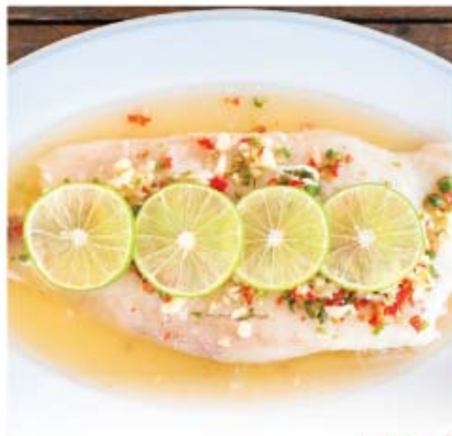
Clean Basa or Swai Filet