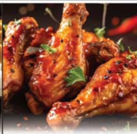
Fresh Never Frozen Chicken Drumsticks