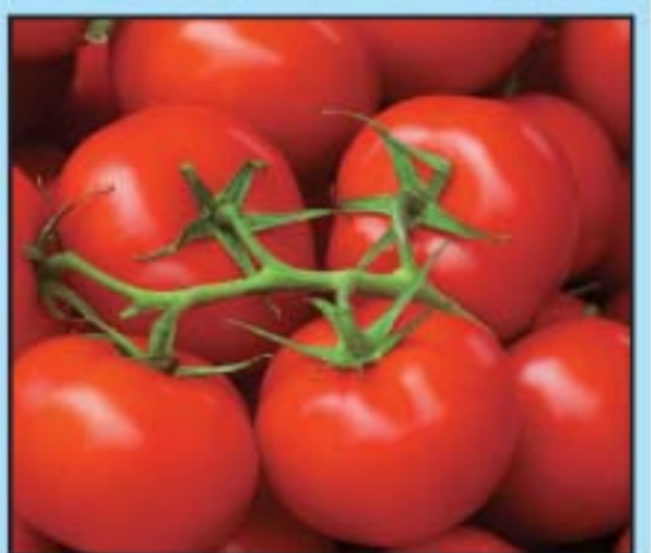
Hothouse Tomatoes On the Vine