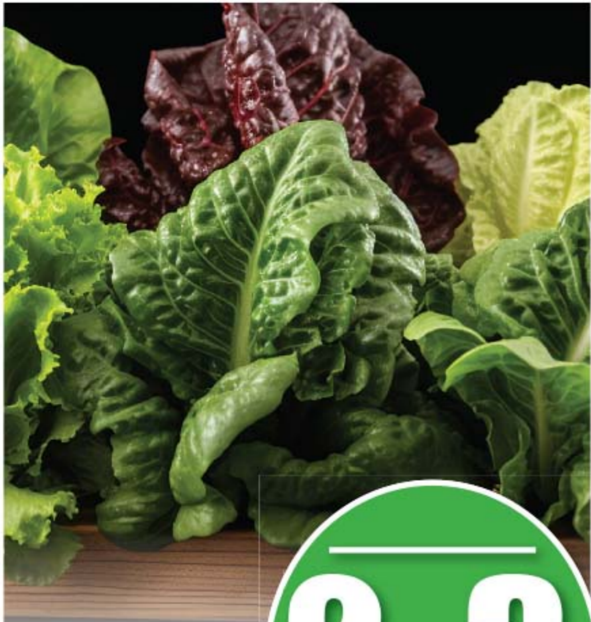
Romaine, Red or Green Leaf Lettuce