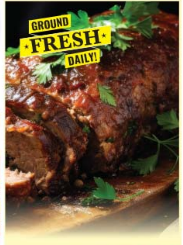
90% Extra Lean Ground Beef