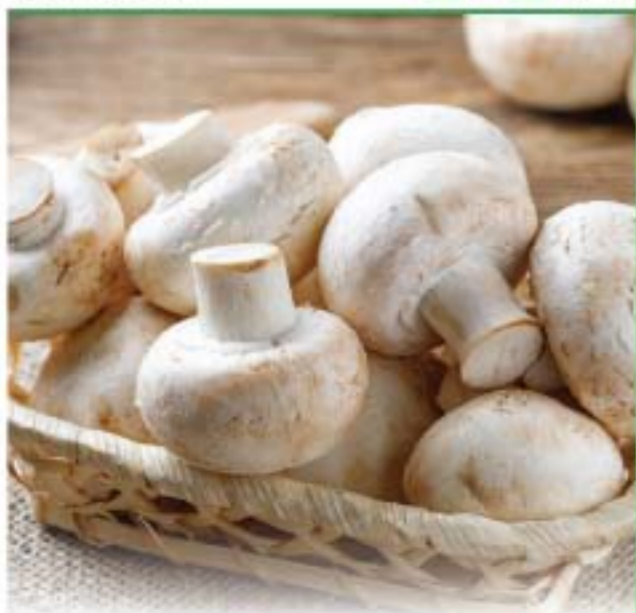
Monterey Whole White Mushrooms 8 oz.