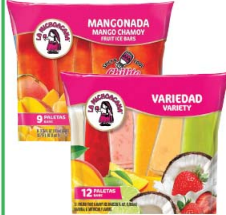
La Michoacana Fruit Ice Bars 12 ct. or Mangonada 9 ct.