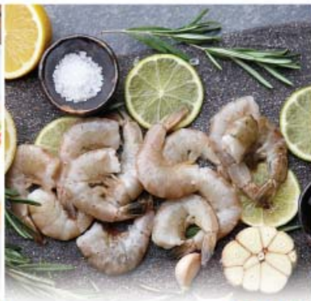
Jumbo Raw Shrimp 16-20 count