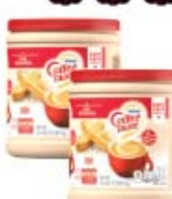
Coffeemate Powder 35.3 oz.