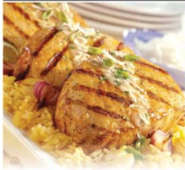
Fresh, Boneless Center Cut Pork Loin Chops