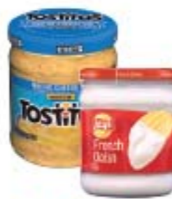
Lay's or Tostitos Dips 10-15.75 oz.