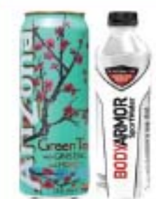
Arizona Tea 23 oz. or Body Armor Sport Water 1 liter