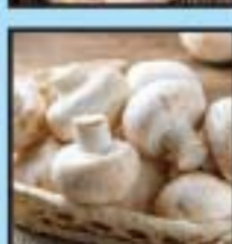
Monterey Whole White Mushrooms 8 oz.