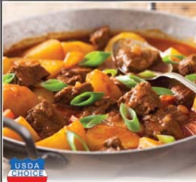
USDA Choice Lean Sirloin Tip Stew Meat