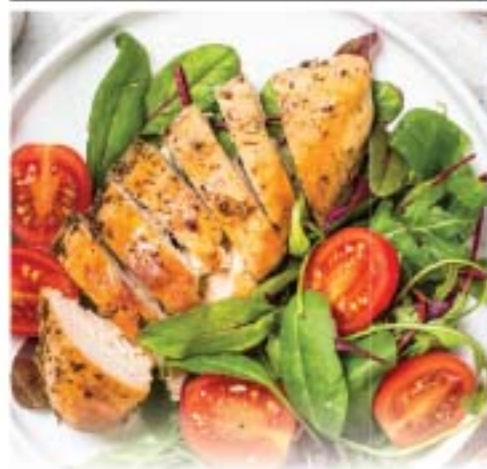
Fresh Never Frozen Boneless Skinless Chicken Breast