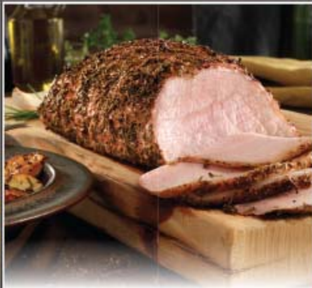
Fresh, Boneless Pork Loin Roast