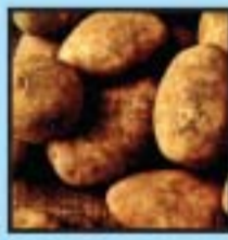
Premium Russet Potatoes