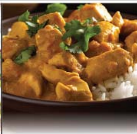
Fresh Never Frozen Boneless Skinless Chicken Leg Meat