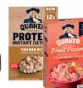
Quaker Protein or Fruit Fusion Instant Oatmeal 8 count