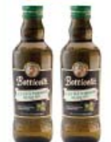
Botticelli Extra Virgin Olive Oil 16.9 oz.