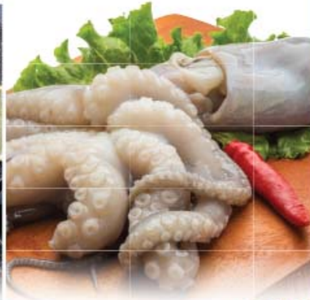
Wild Caught Whole Octopus 3-4 lbs.