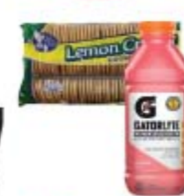
Lil' Dutch Maid Crème Cookies 25 oz. or Gatorlyte 20 oz.