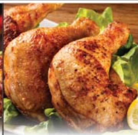
Fresh Never Frozen Chicken Leg Quarters