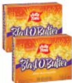
Jolly Time Blast O Butter Popcorn 6 pack