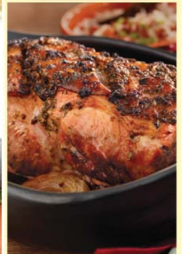
Fresh Whole Pork Butt Roast