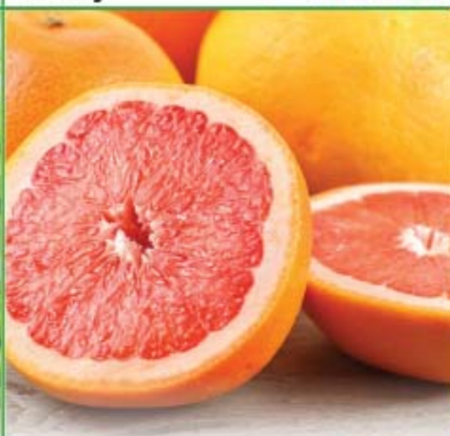
Pink Grapefruit 5 lb. bag