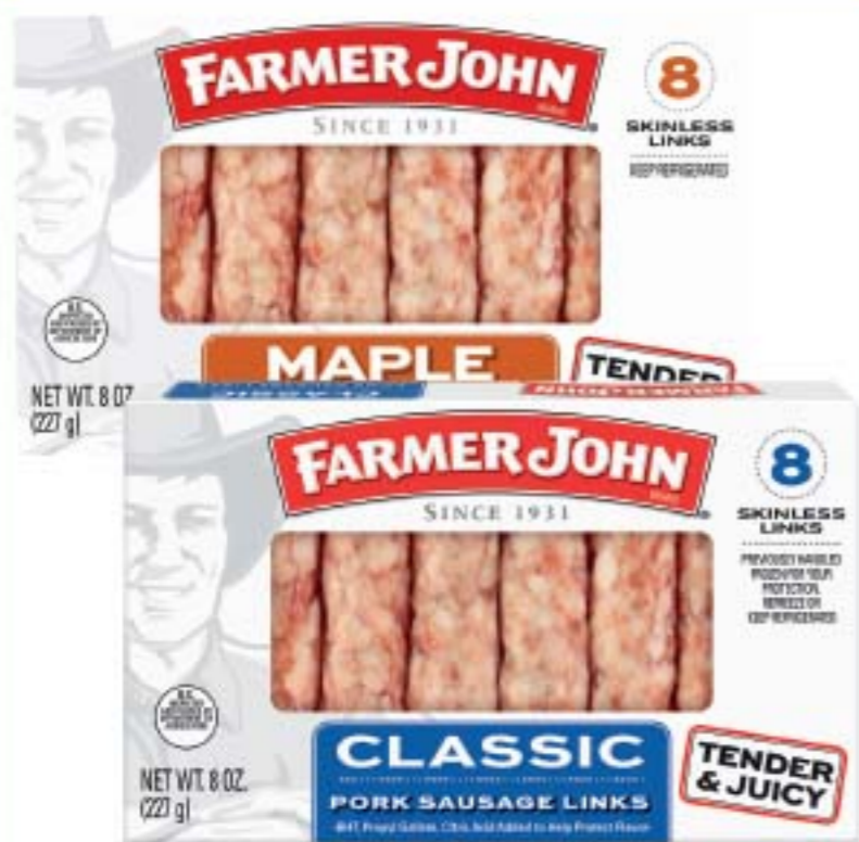
Farmer John Skinless Links 8 oz.