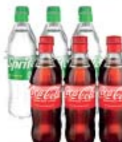
Coca-Cola 6 pack, .5 liter bottles