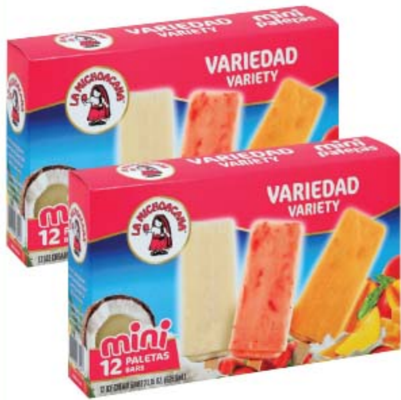
La Michoacana Mini Ice Cream Bars 12 ct.