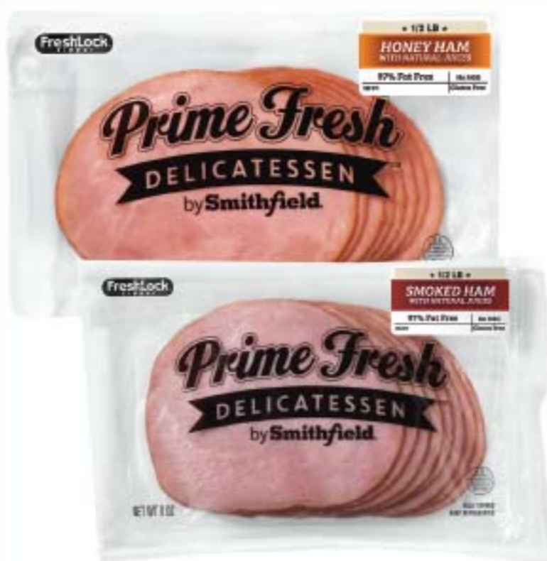
Prime Fresh Deli Meats 7-8 oz.