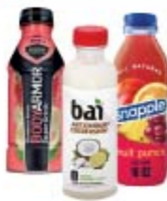
Snapple or Bai 16-18 oz. or Body Armor 16 oz.