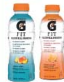
Gatorade Fit 16.9 oz.