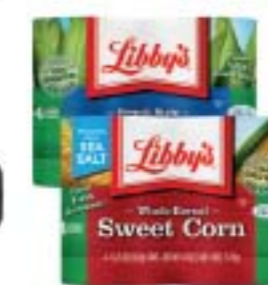
Libby's Vegetable 4 pack cans