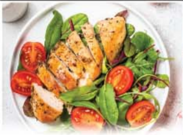
Fresh Never Frozen Boneless Skinless Chicken Breast