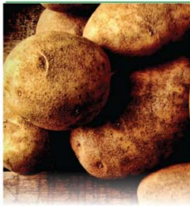
Premium Russet Potatoes