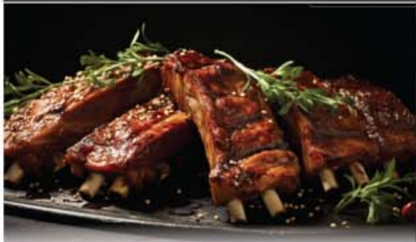
Fresh Pork Butt Country Style Ribs