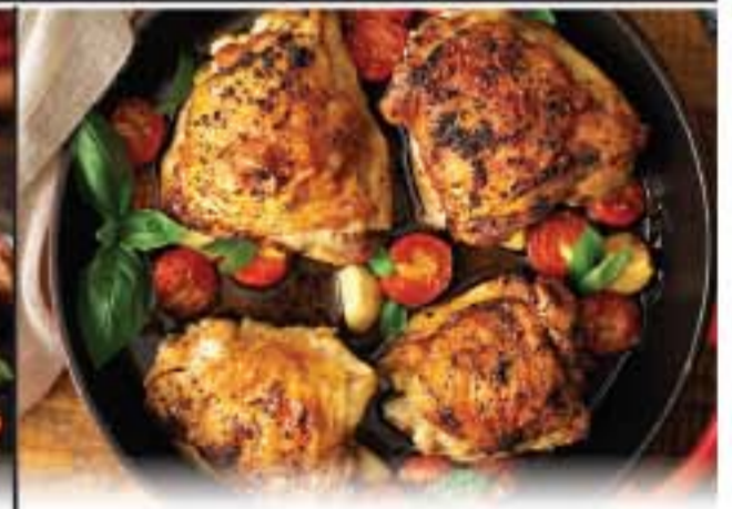
Fresh Never Frozen Chicken Thighs