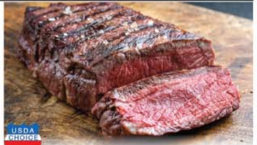
USDA Choice, Lean Sirloin Tip Steaks