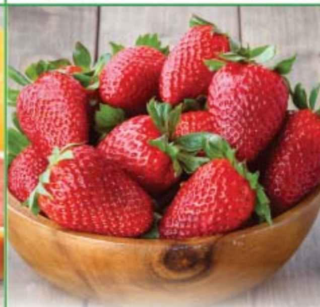
Strawberries 1 lb.