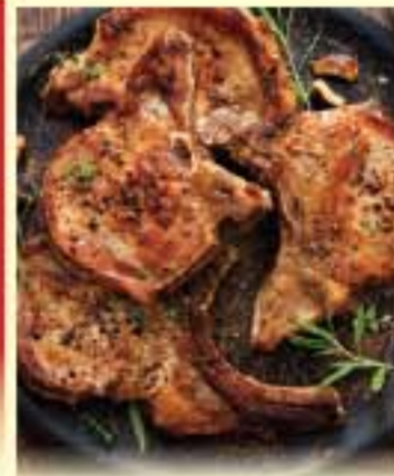
Previously Frozen Pork Sirloin Chops 1.79 lb.