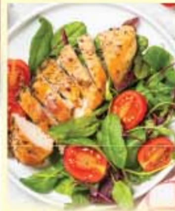
Fresh Never Frozen Boneless Skinless Chicken Breast 2.79 lb.