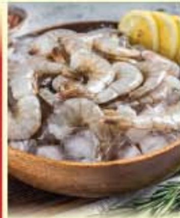
Large Raw Shrimp 31-40 count 4.99 lb.