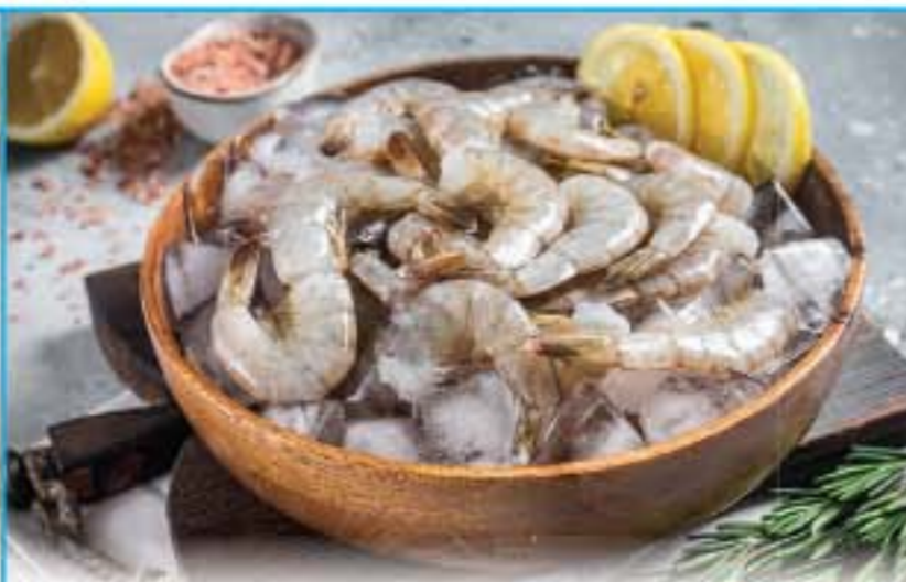
Jumbo Raw Shrimp 16-20 count