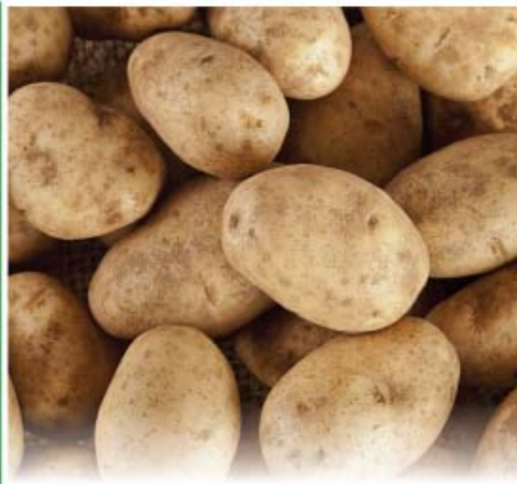
Potatoes 10 lb. bag