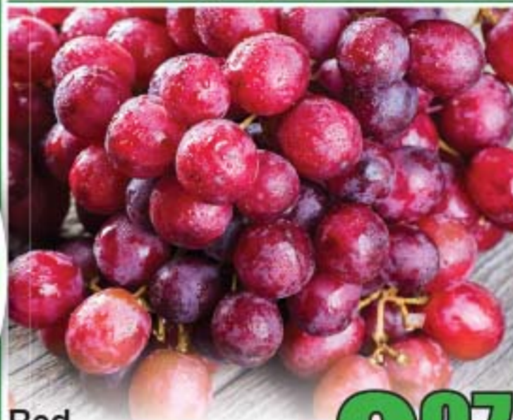
Red Seedless Grapes