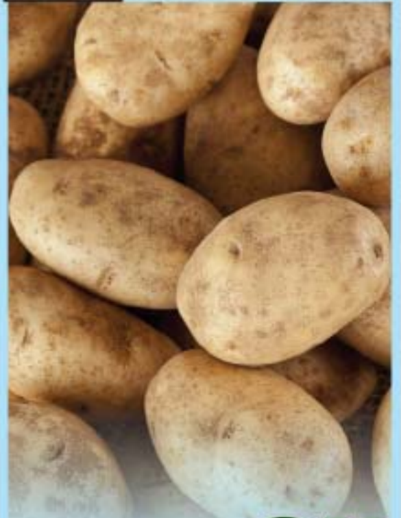
Potatoes 10 lb. bag