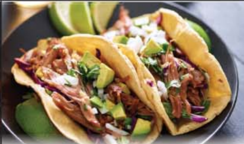
Fresh Boneless Pork Cubes, Carnitas or Pozole Meat