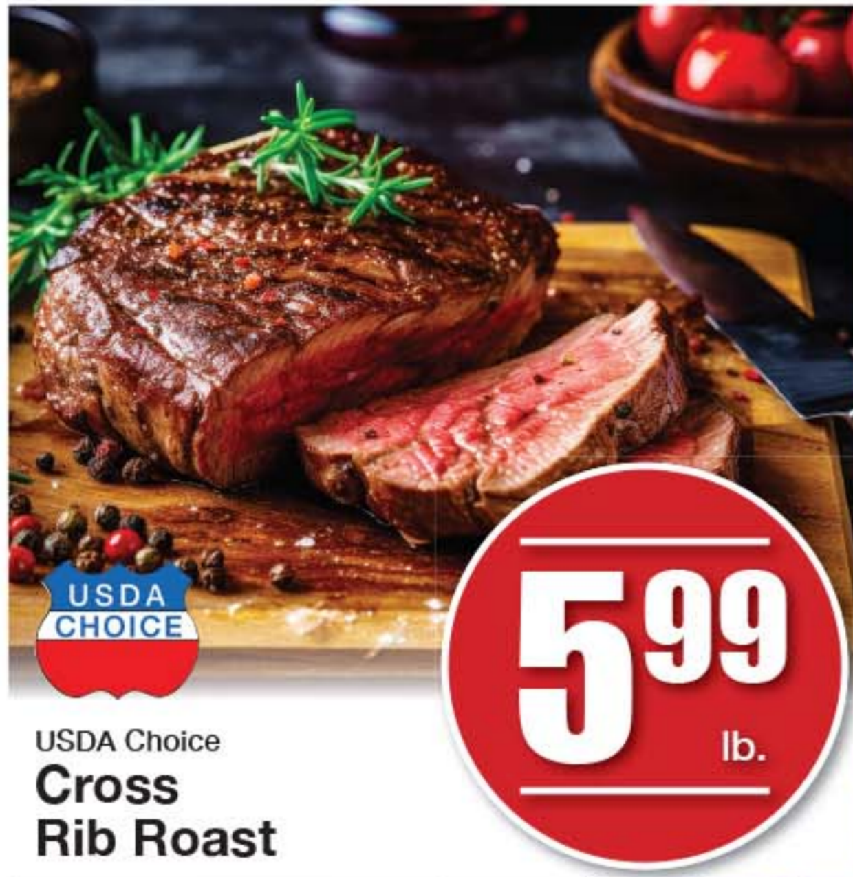
USDA Choice Cross Rib Roast