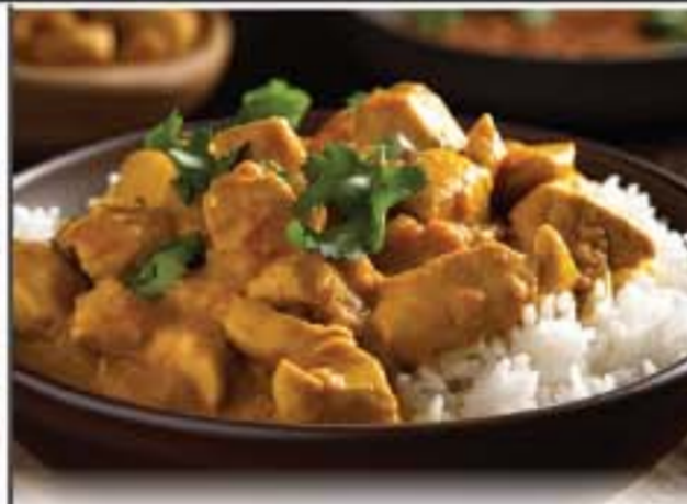
Fresh Never Frozen Boneless Skinless Chicken Leg Meat