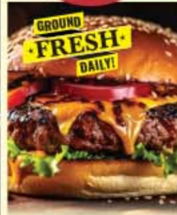
90% Extra Lean Ground Beef 5.99 lb.