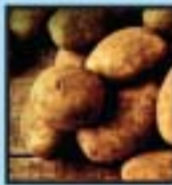
Premium Russet Potatoes