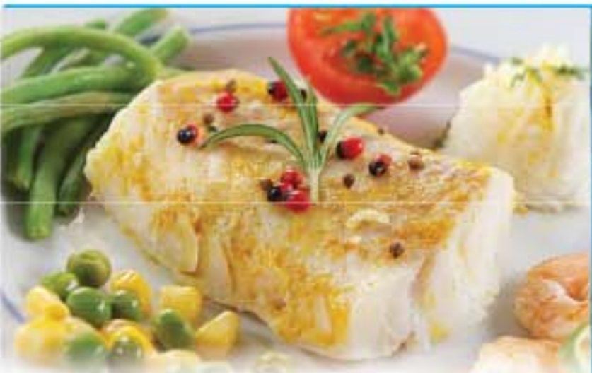
Wild Caught Cod Fillet