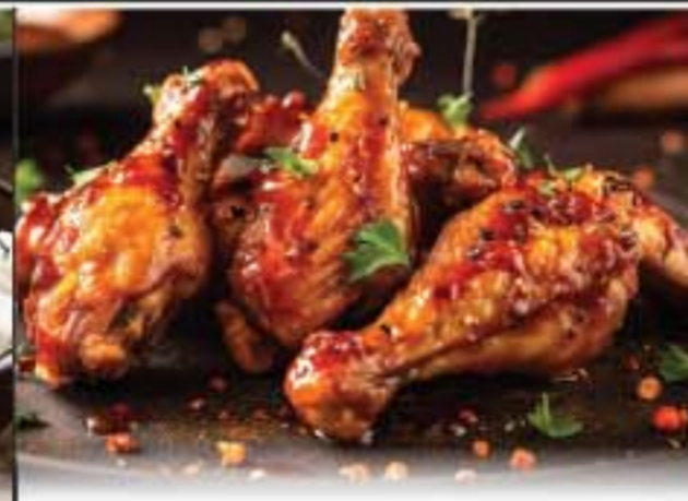
Fresh Never Frozen Chicken Drumsticks