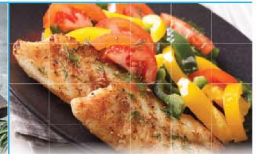
Ready to Cook Clean Tilapia Fillet