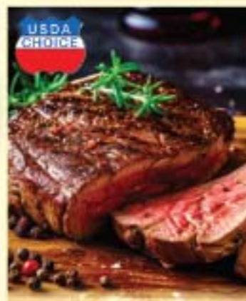
USDA Choice Family Pack Cross Rib Roast