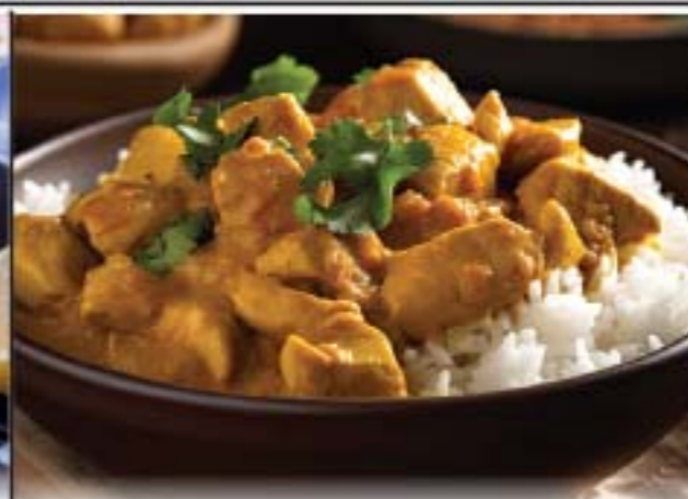
Fresh, Never Frozen Boneless Skinless Chicken Leg Meat