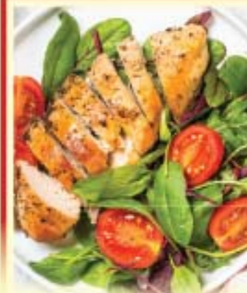
Fresh Never Frozen Boneless Skinless Chicken Breast