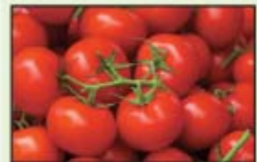
Hothouse Tomatoes On the Vine