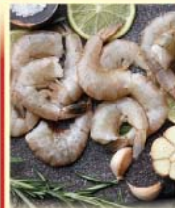
31-40 count Large Raw Shrimp