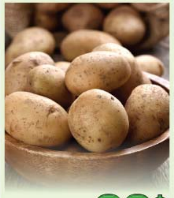
Potatoes 5 lb. bag