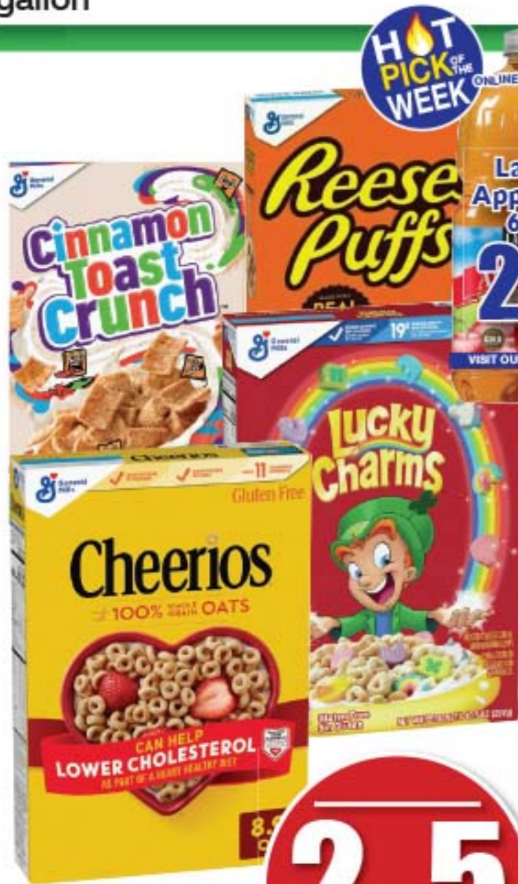
Big G Cereal 8.9-12.3 oz.