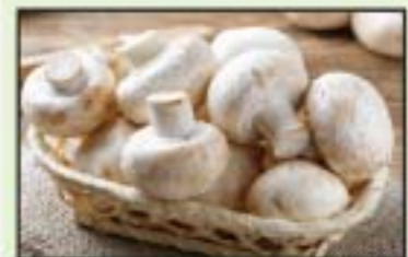
Whole Monterey Mushrooms 8 oz.