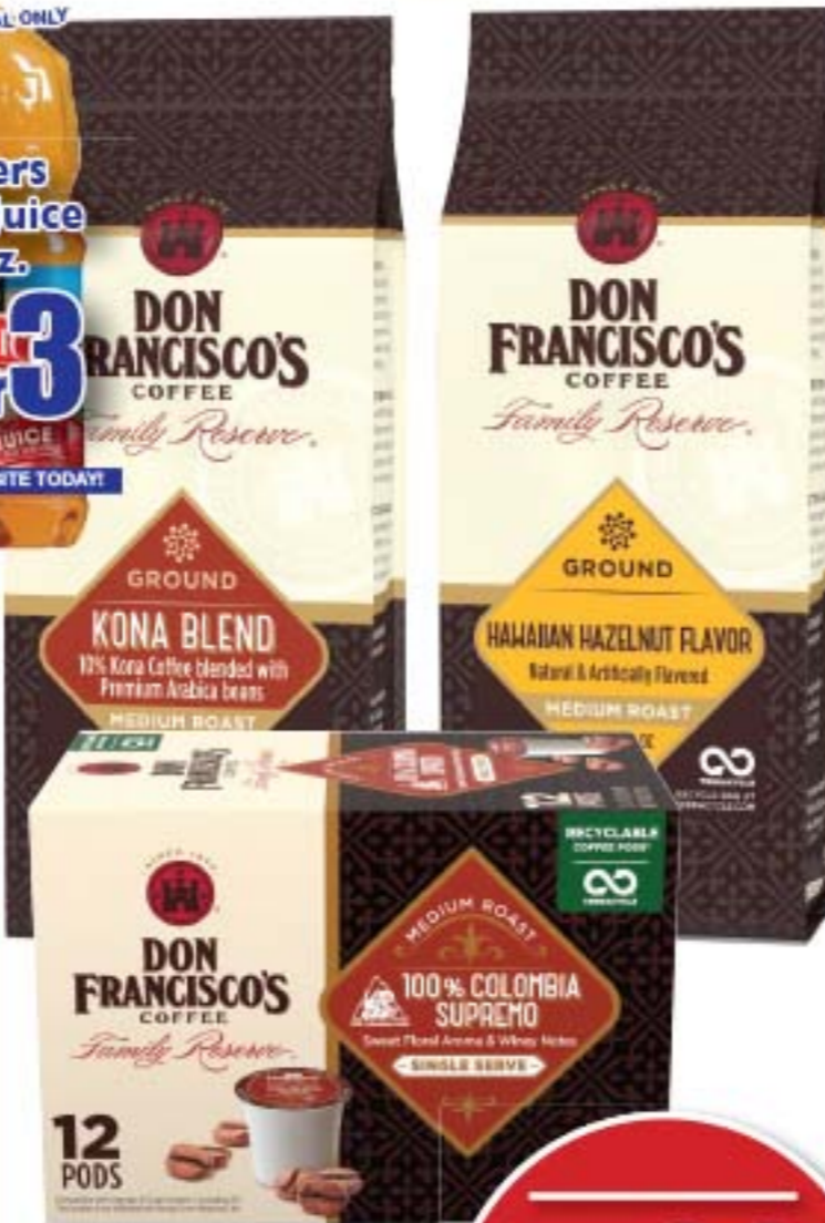
Don Francisco's Coffee 10-12 oz. bag or 12 count pods