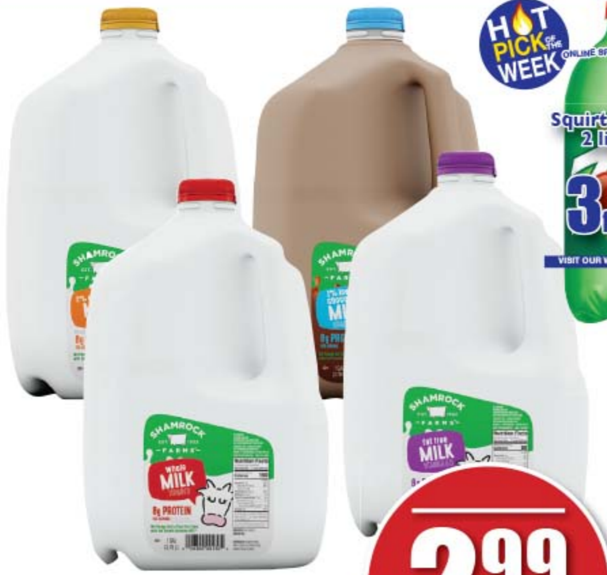
Shamrock Farms Milk gallon