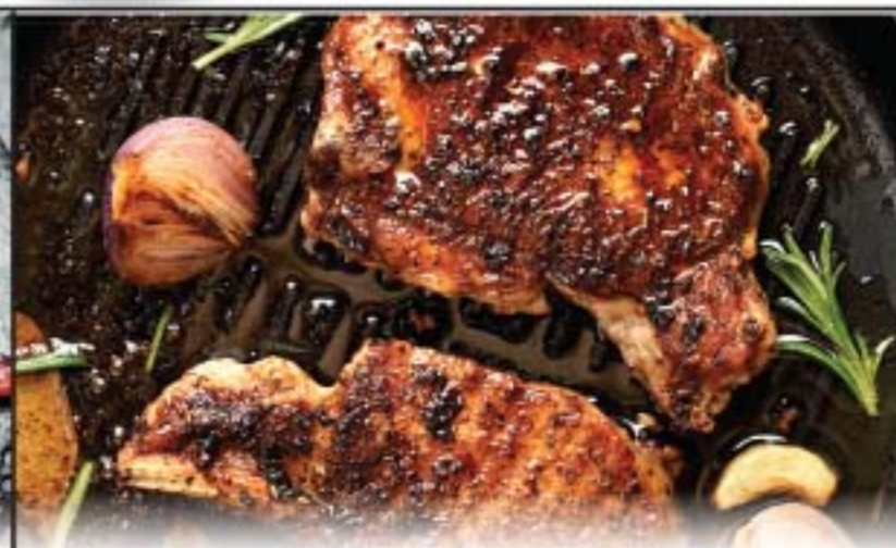
Ready to Grill Adobada Pork Steaks