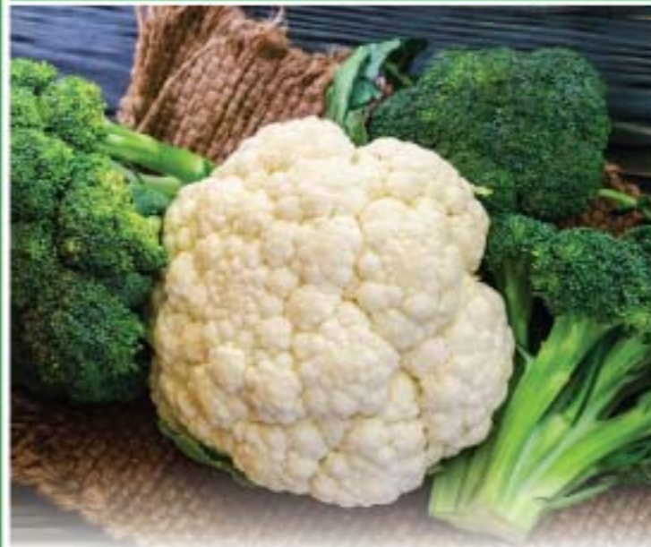
Broccoli or Cauliflower