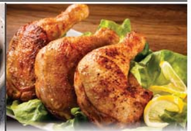
Fresh, Never Frozen Chicken Leg Quarters