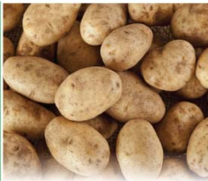
Potatoes 4.5 lb. bag