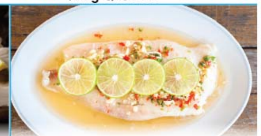
Clean Basa or Swai Fillet