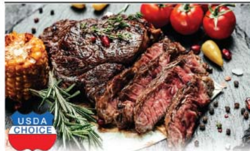
USDA Choice Center Cut Boneless Chuck Roast