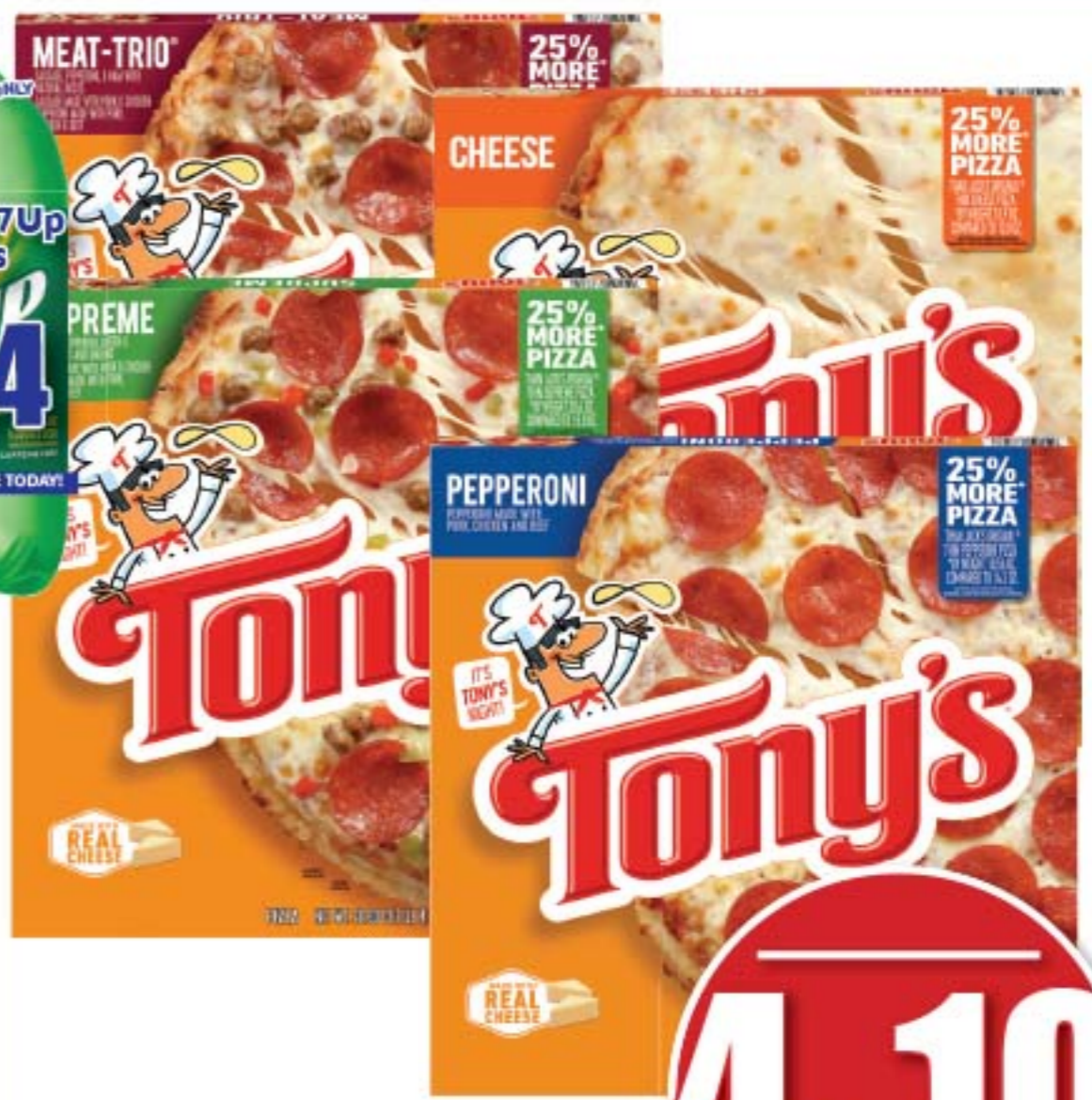
Tony's Pizza assorted