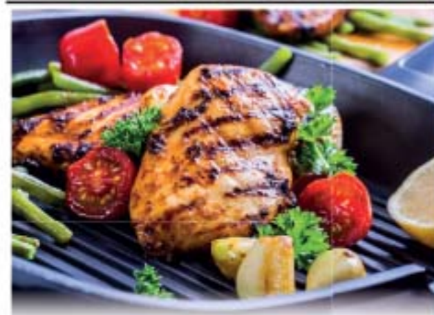
Fresh, Never Frozen Boneless Skinless Chicken Breast