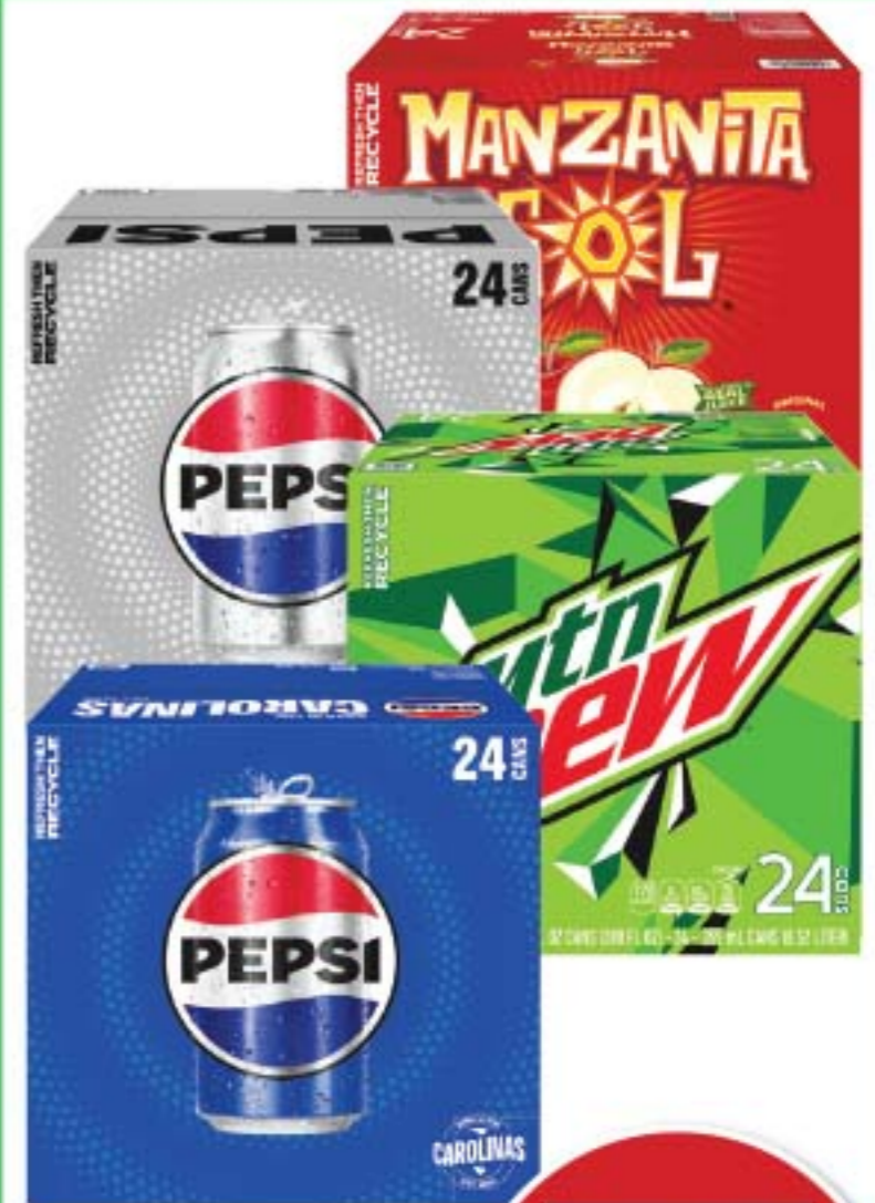
Pepsi 24 pack First 2 All Others 10.99