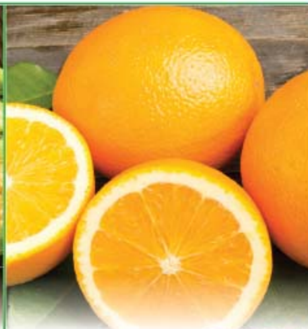
Large Navel Oranges