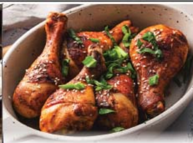
Fresh, Never Frozen Chicken Drumsticks