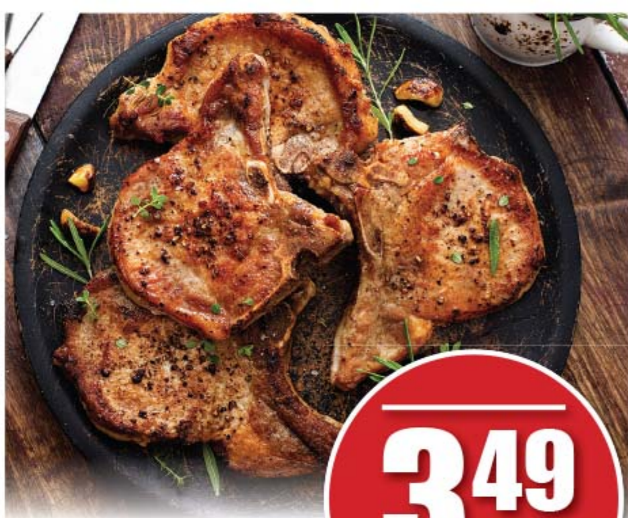
Center Cut Pork Loin Chops