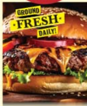
80% Lean Ground Beef