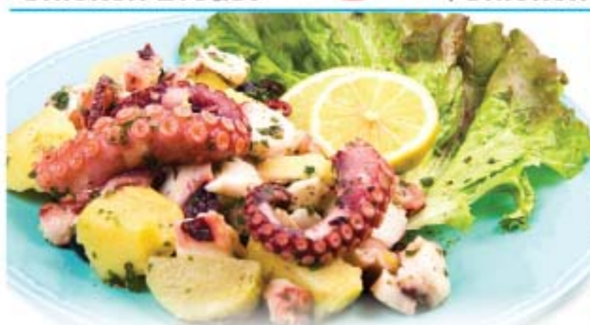
Wild Caught Whole Octopus