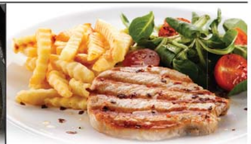
Fresh, Never Frozen Pork Butt Steaks