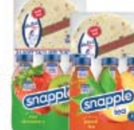
La La's Soft Taco Tortillas 24 count or Snapple 6 pack, 16 oz.