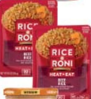
Rice a Roni Heat & Eat Beef Rice 8.8 oz.