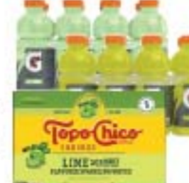
Gatorade 8 pack, 20 oz. or Topo Chico Sabores 8 pack