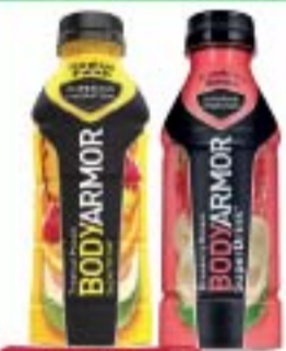
Body Armor 16 oz.