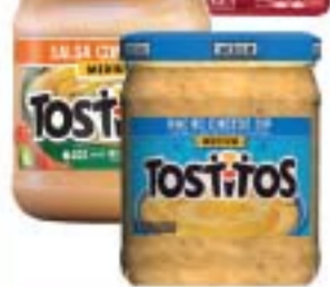
Tostitos Dip 15-15.75 oz.