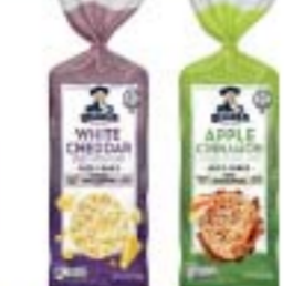
Quaker Rice Cakes 4.47-7.2 oz.