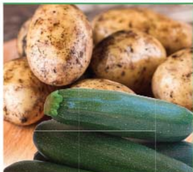
Italian Squash Premium Russet Potatoes