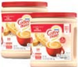
Coffee-Mate Creamer Powder 35.3 oz.