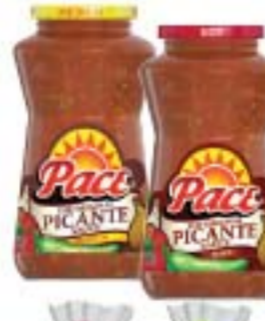
Pace Picante Sauce 16 oz.