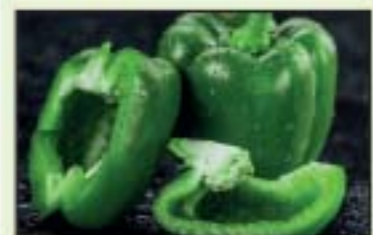
Green Bell Peppers