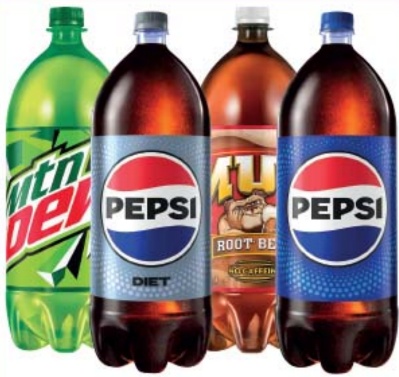
Pepsi 2 liter