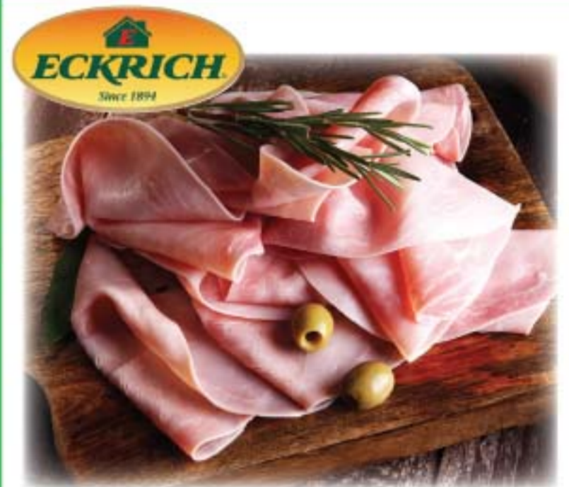
Eckrich Ham Virginia Honey or Black Forest