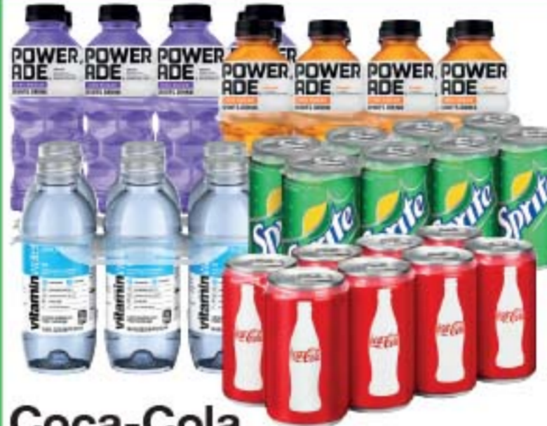
Coca-Cola 8 pack, 7.5 oz. cans, Powerade 8 pack, 20 oz. or Vitamin Water 6 pack