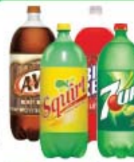
Squirt or 7-Up 2 liter