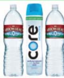
Arrowhead Mountain Spring Water 1.5 liter or Core Water 30.4 oz.