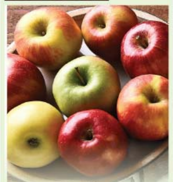
Granny Smith, Red Delicious or Fuji Apples 3 lb. bag