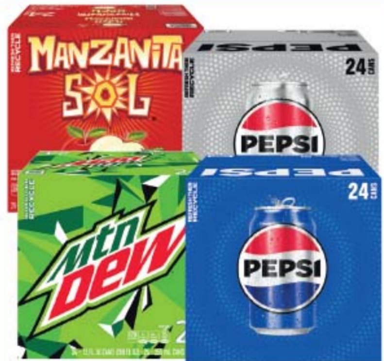
Pepsi 24 pack