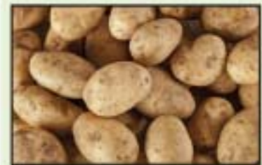
Potatoes 10 lb. bag