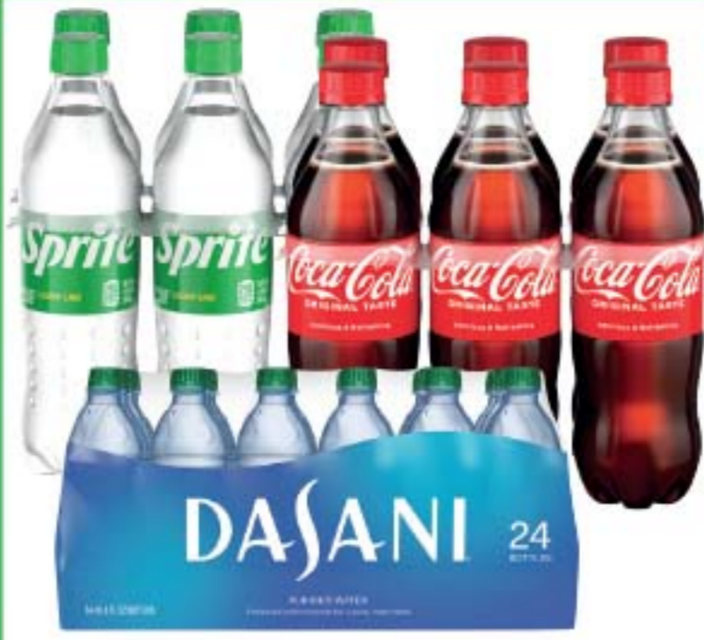
Dasani 24 pack or Coca-Cola 6 pack, .5 liter