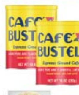
Café Bustelo Espresso Cans 10 oz.