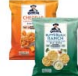
Quaker Rice Crisps 6.06-7.04 oz.