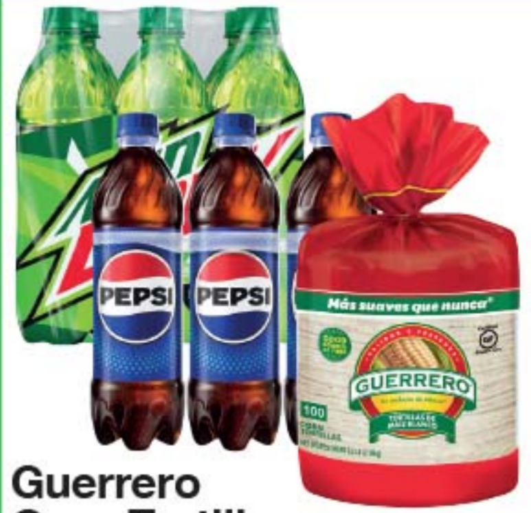
Guerrero Corn Tortillas 100 count or Pepsi 6 pack, .5 liter