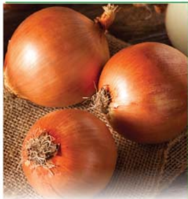
Brown or Yellow Onions