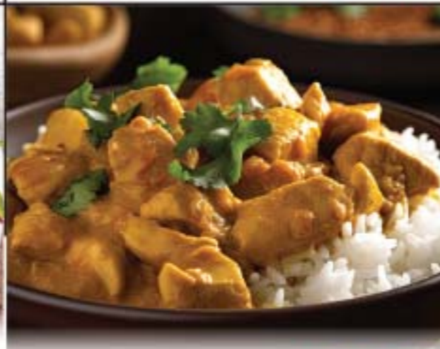
Fresh, Never Frozen Boneless Skinless Chicken Leg Meat