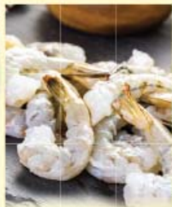
31-40 count Medium Raw Shrimp