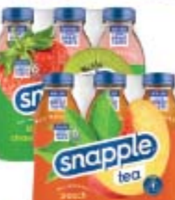
Snapple 6 pack, 16 oz.