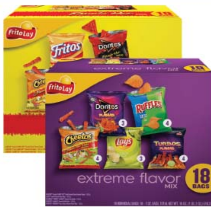
Frito-Lay Variety Pack 18 count