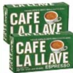
Café La Llave Espresso Brick Bags 10 oz.