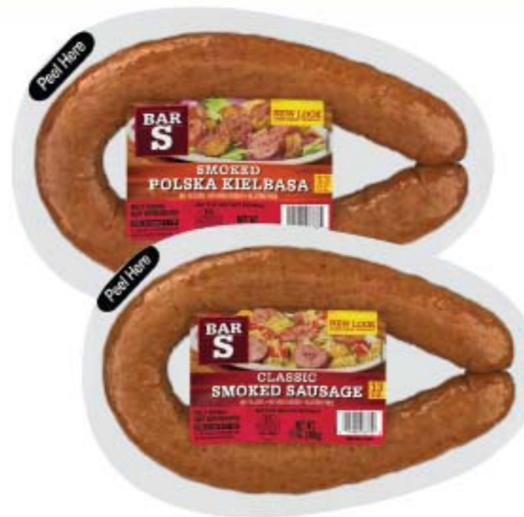
Bar-S Loop Sausage 13 oz.