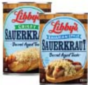
Libby's Sauerkraut 14.5-15 oz.