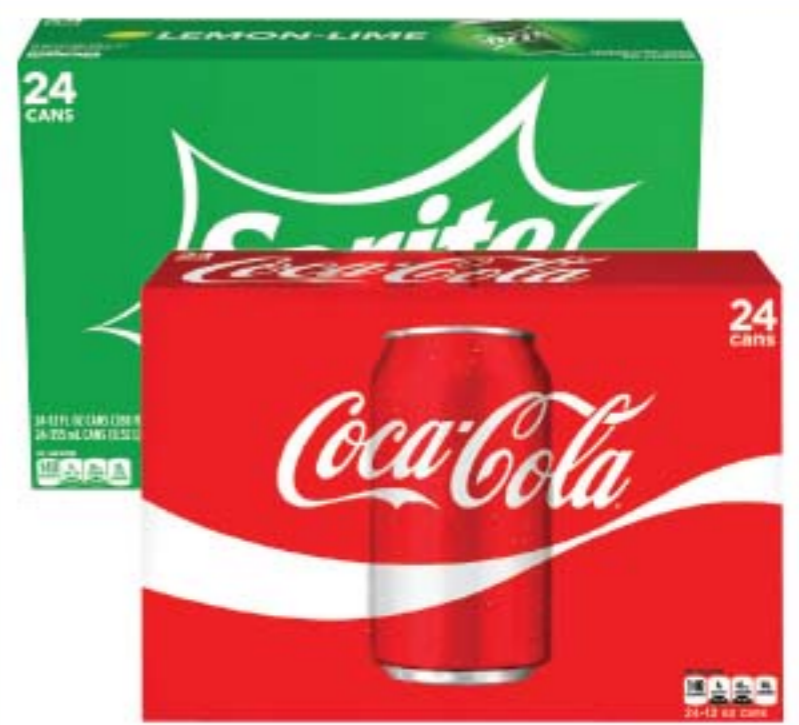
Coca-Cola 24 pack