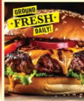
85% Lean Ground Beef