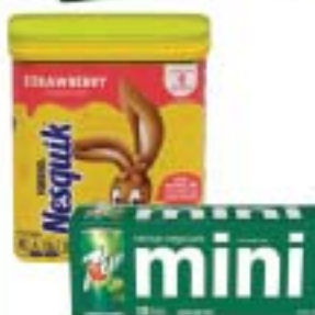
Nesquik Chocolate or Strawberry Powder 18-20 oz. or Squirt or 7-Up 10 pack, 7.5 oz. cans