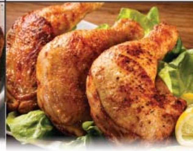
Fresh, Never Frozen Chicken Drumsticks