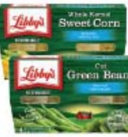
Libby's Vegetable Cups 4 pack, 4 oz.