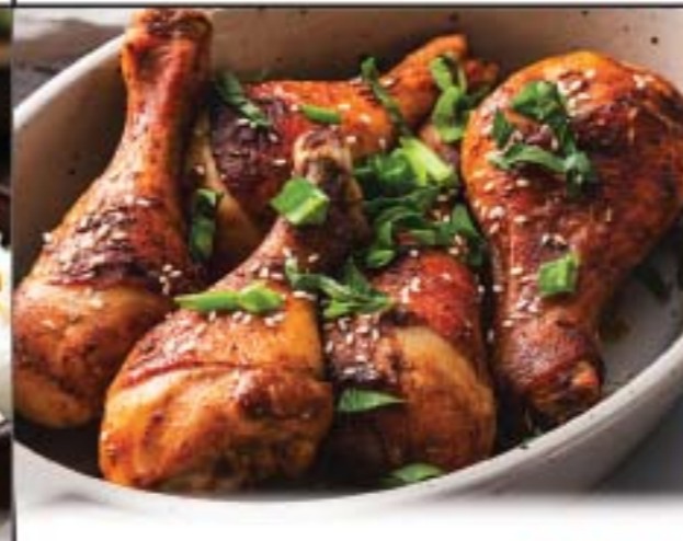
Fresh, Never Frozen Chicken Drumsticks