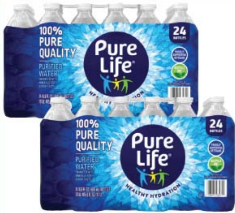
Pure Life Water 24 pack, 16.9 oz.