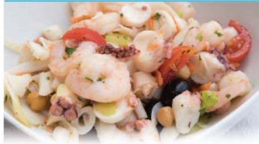
Wild Caught Seafood Mix