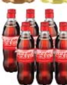
Coca-Cola 6 pack, 16.9 oz.