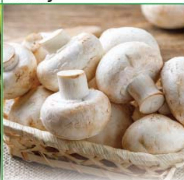
Monterey Whole White Mushrooms