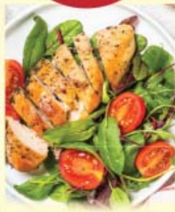
Fresh Never Frozen Boneless Skinless Chicken Breast