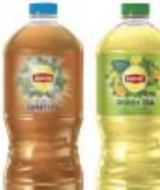
Lipton Tea 64 oz.