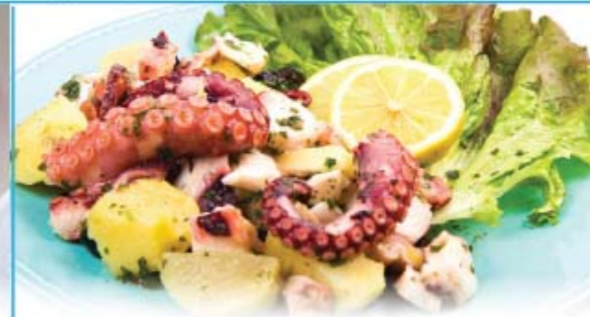
Cooked Cut Octopus