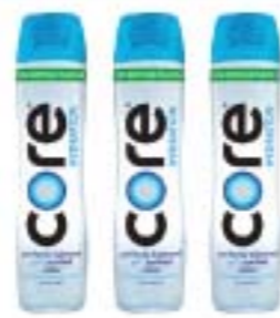
Core Water 30.4 oz.