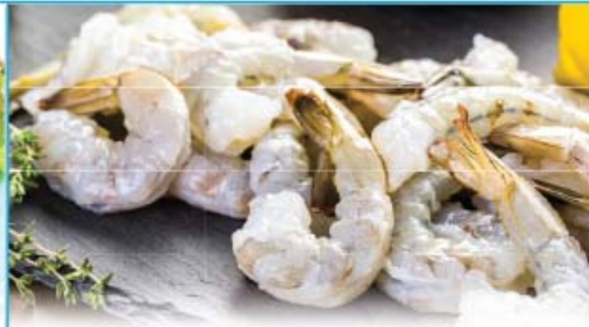
Extra Large Raw Shrimp 26-30 count