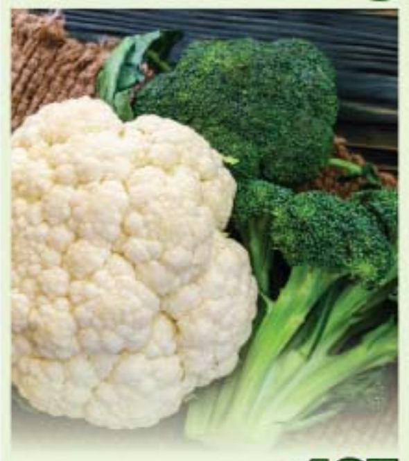
Broccoli or Cauliflower