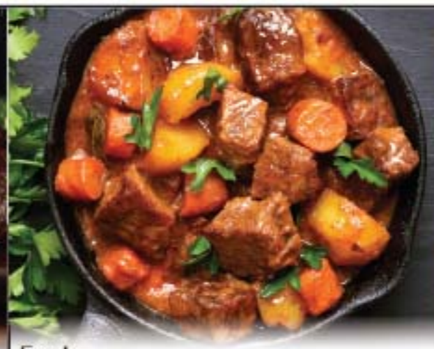
Fresh Boneless Pork Carnitas or Cubes