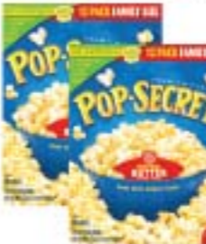
Pop Secret Popcorn 12 count