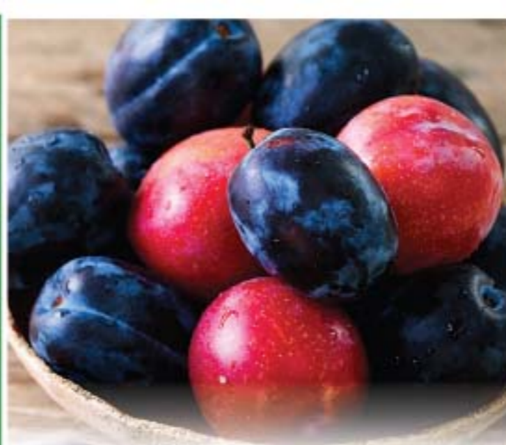
Red or Black Plums