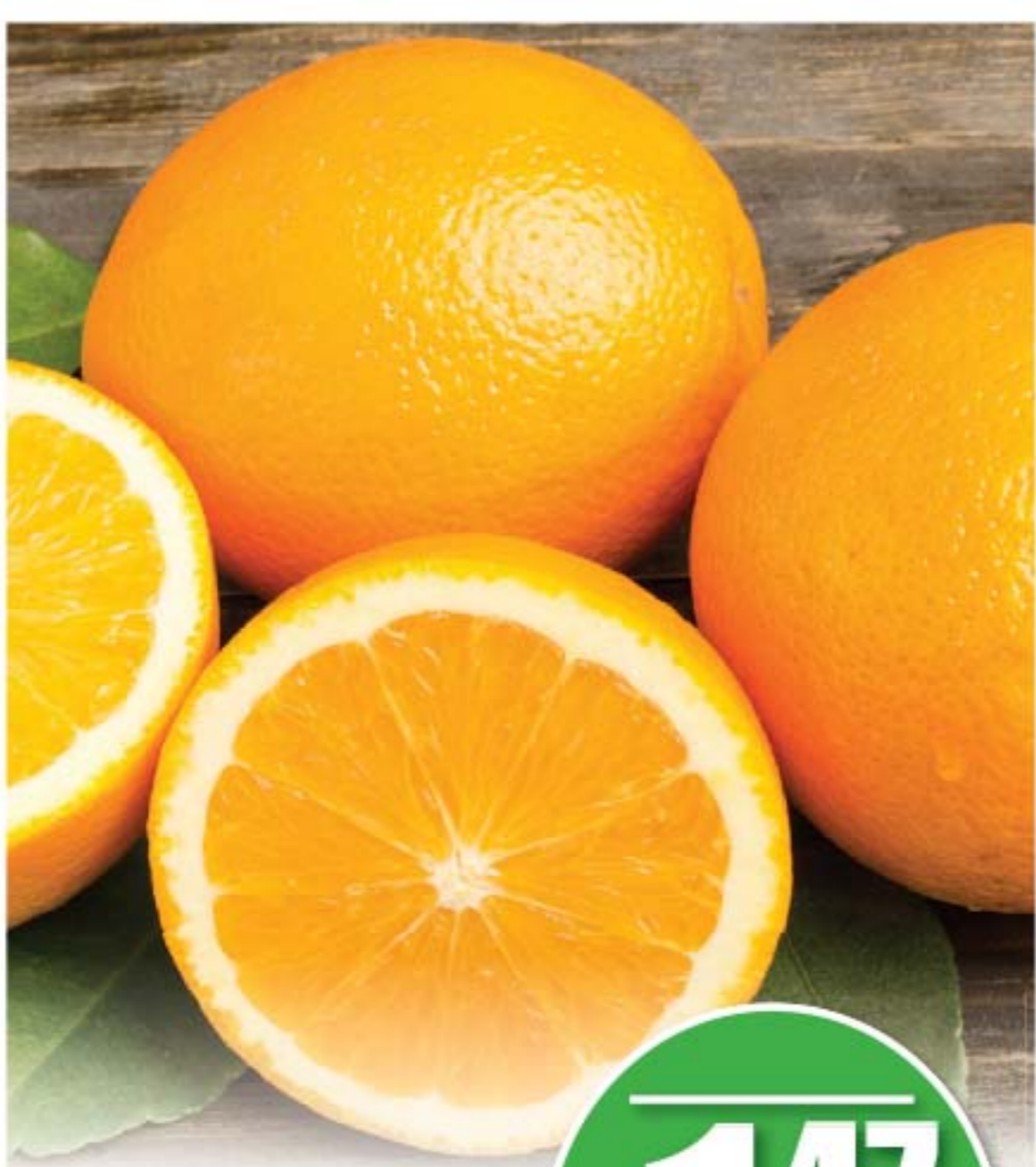
Large Navel Oranges