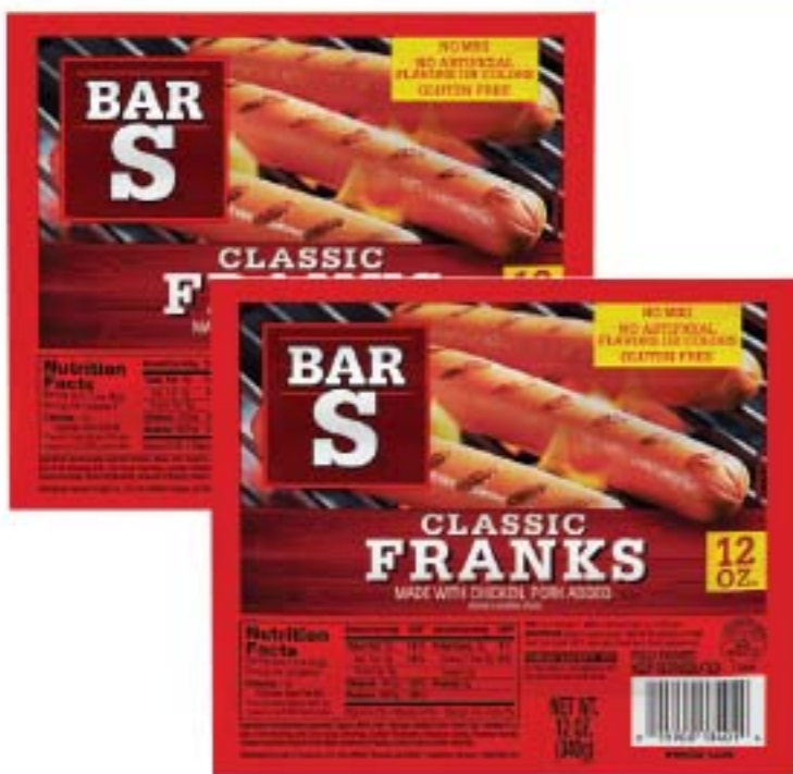
Bar-S Meat Franks 12 oz.