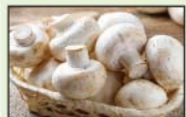
Monterey Whole White Mushrooms