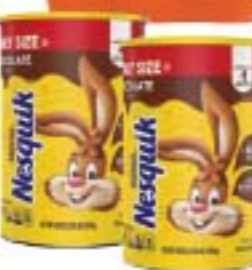
Nesquik Chocolate Powder 38 oz.