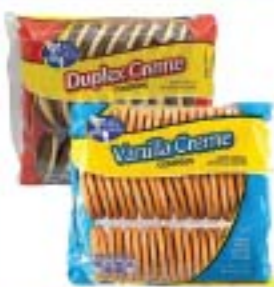
Lil' Dutch Maid Crème Cookies 11.8 oz.