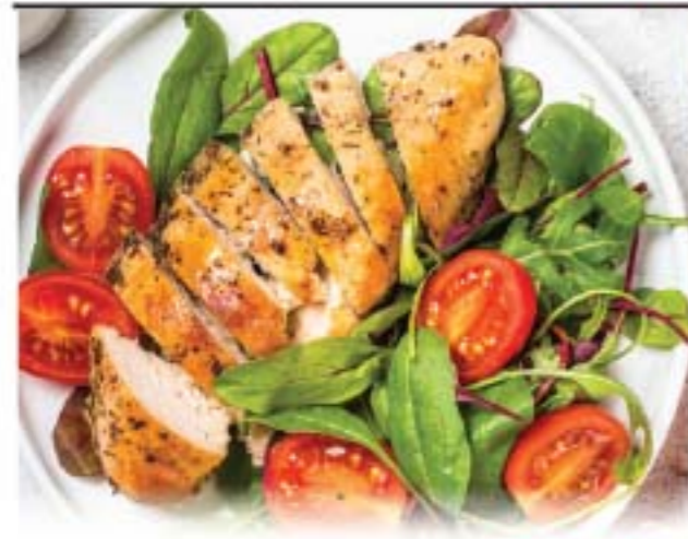
Fresh, Never Frozen Boneless Skinless Chicken Breast