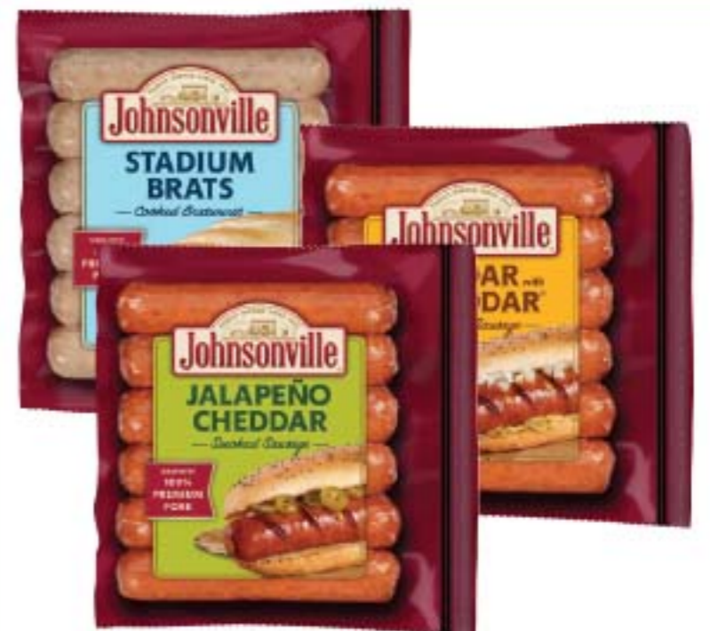
Johnsonville Brats, Hot or Cheddar Links 12-14 oz.