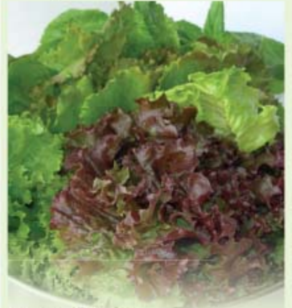
Red, Green Leaf or Romaine Lettuce

Wednesday & Thursday September 11th & 12th