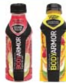
Body Armor 16 oz.